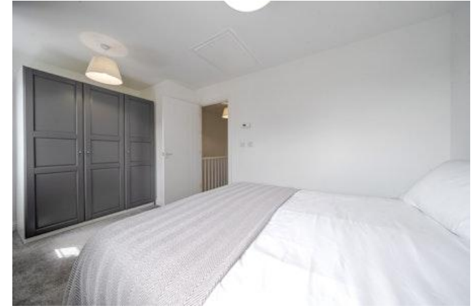
Bedroom three 3.79m x 1.82m (12'5" x 6'0")