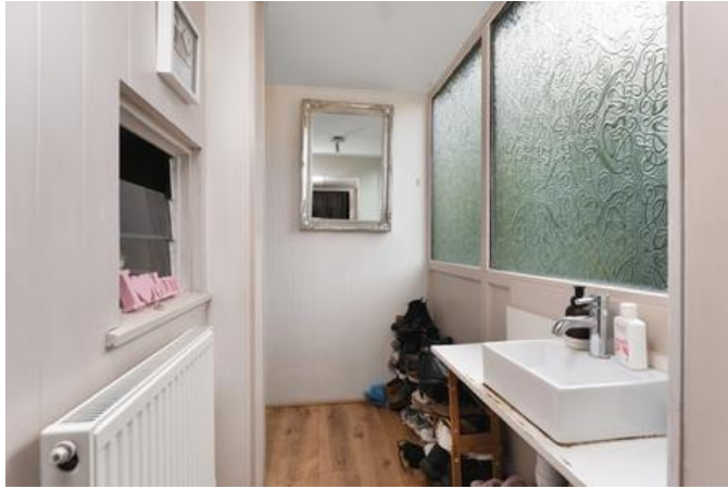
Entrance Hall 1.94m x 1.05 (6.4ft x 3.4ft)