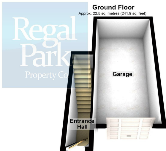
Total area: approx. 22.5 sq. metres (241.9 sq. feet)