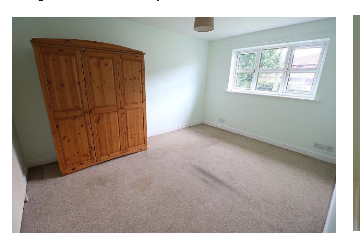
BEDROOM 2 9' 5" x 8' 10" (2.888m x 2.704m) Front facing window. Radiator. Fitted display workstation.