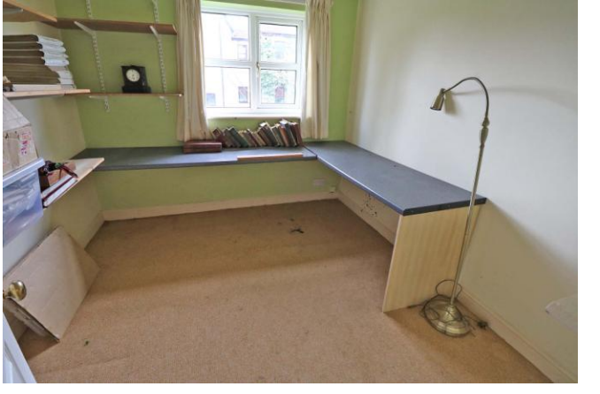
BEDROOM 3 11' 11" x 11' 10" (3.639m x 3.630m) Dual aspect windows. Built in wardrobes. Radiator.