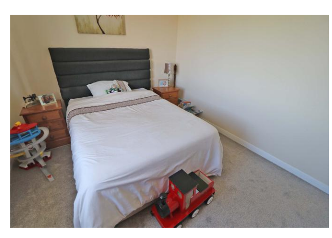
BEDROOM 3 12' 8" x 9' 9" (3.869m x 2.981m) Rear facing window overlooking garden. Radiator.

BEDROOM 4 9' 1" x 8' 11" (2.788m x 2.731m) Front facing window with panoramic views. Radiator