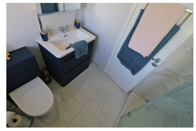
lighting and tap.

BEDROOM 4 9' 1" x 8' 11" (2.788m x 2.731m) Front facing window with panoramic views. Radiator