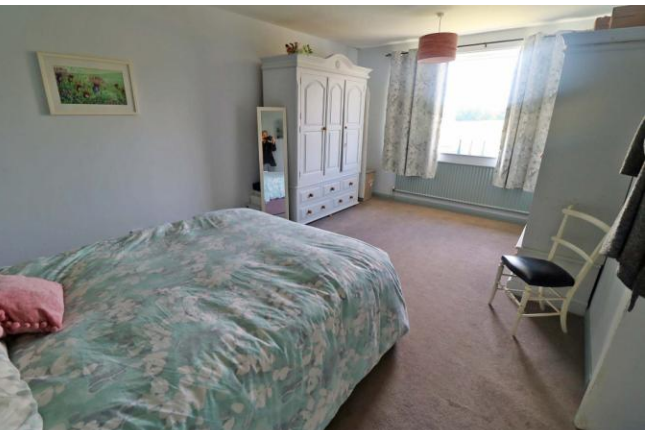
BEDROOM 2 12' 11" x 9' 8" (3.962m x 2.960m) Rear facing window. Front facing tilt and slide partition to balcony with decorative wrought iron railing and panoramic views. Radiator.