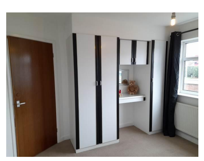
BEDROOM 2: 9' 2" x 8' 11" (2.799m x 2.728m) Rear facing window. One wall of fitted wardrobes, vanity sink unit with tiled splashback and shaving point. Radiator.