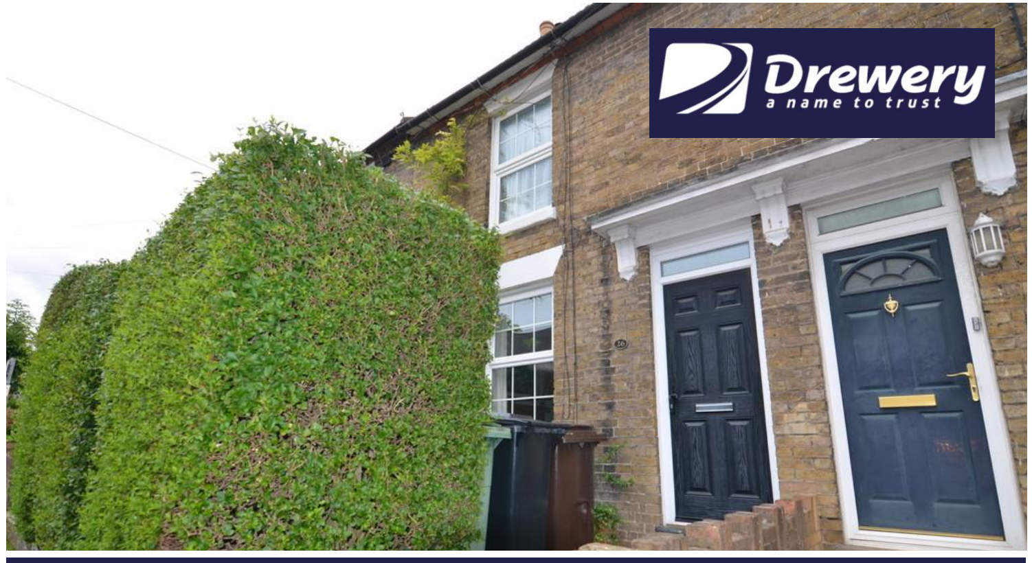
26 Peel Street, Maidstone, ME14 2SA £1,350pcm