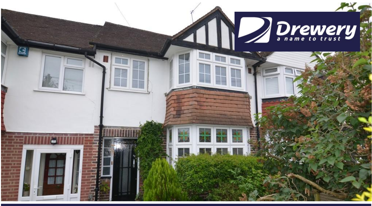
63 Jevington Way, London, SE12 9NG £1,900pcm