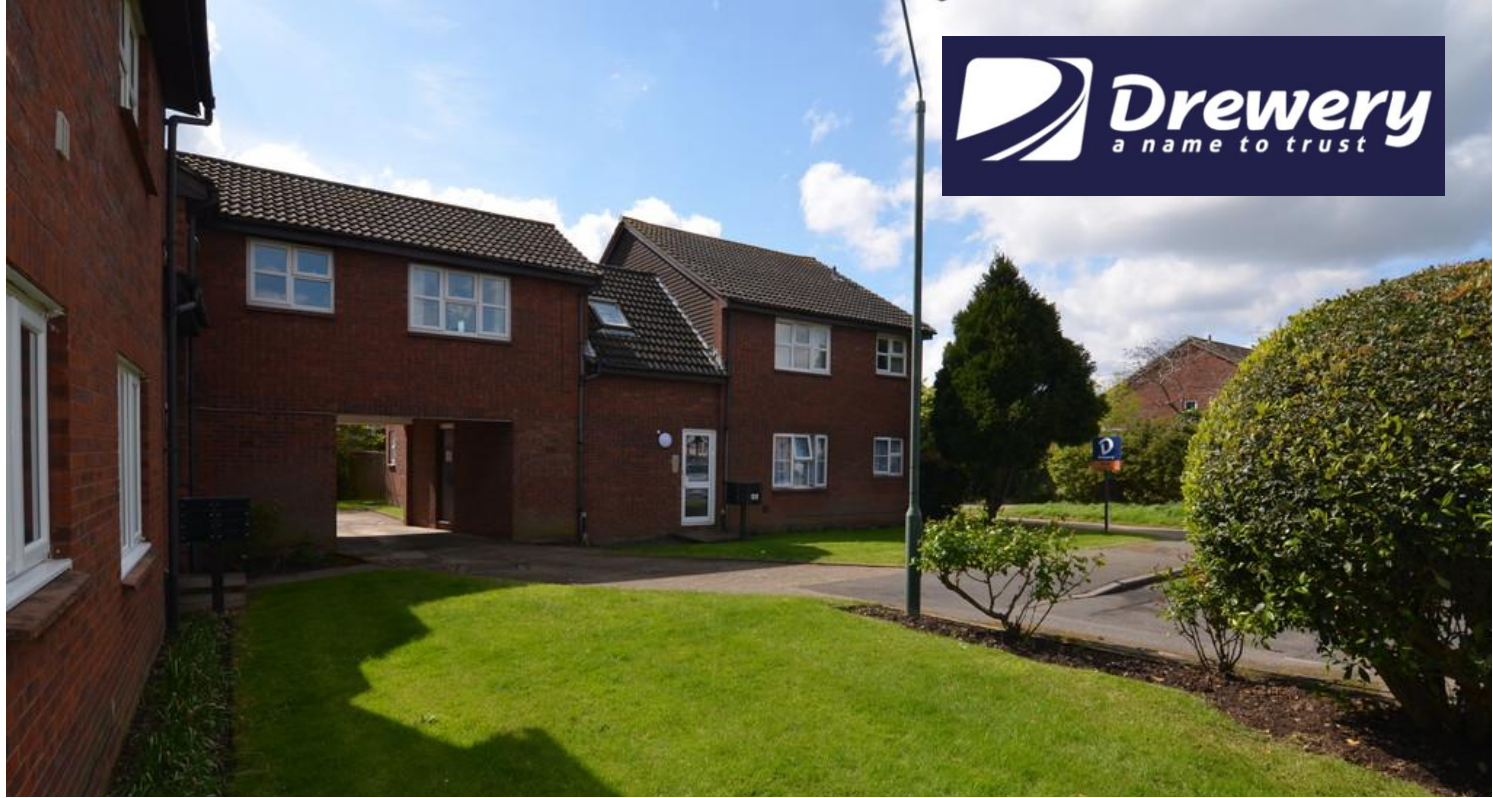
14 Kirkland Close, Sidcup, DA15 8TP £1,000pcm