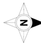
Boundary Road, Sidcup, DA15 Approximate Area = 1351 sq ft / 125.5 sq m For identification only - Not to scale