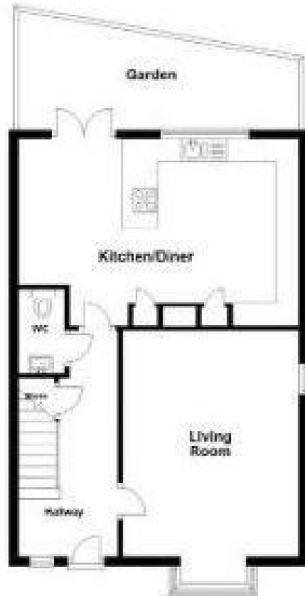
Ground Floor Approx. 262 sq. metres (652.1 sq. feet)