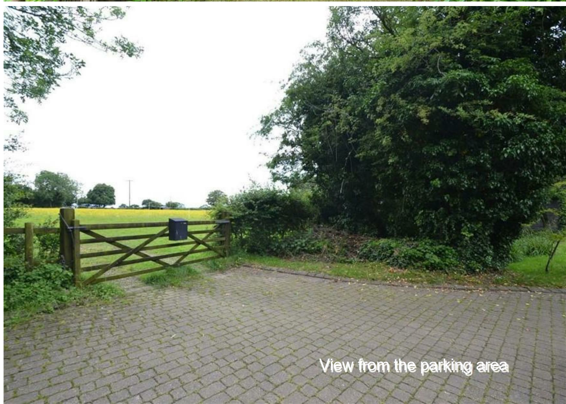
View from the parking area