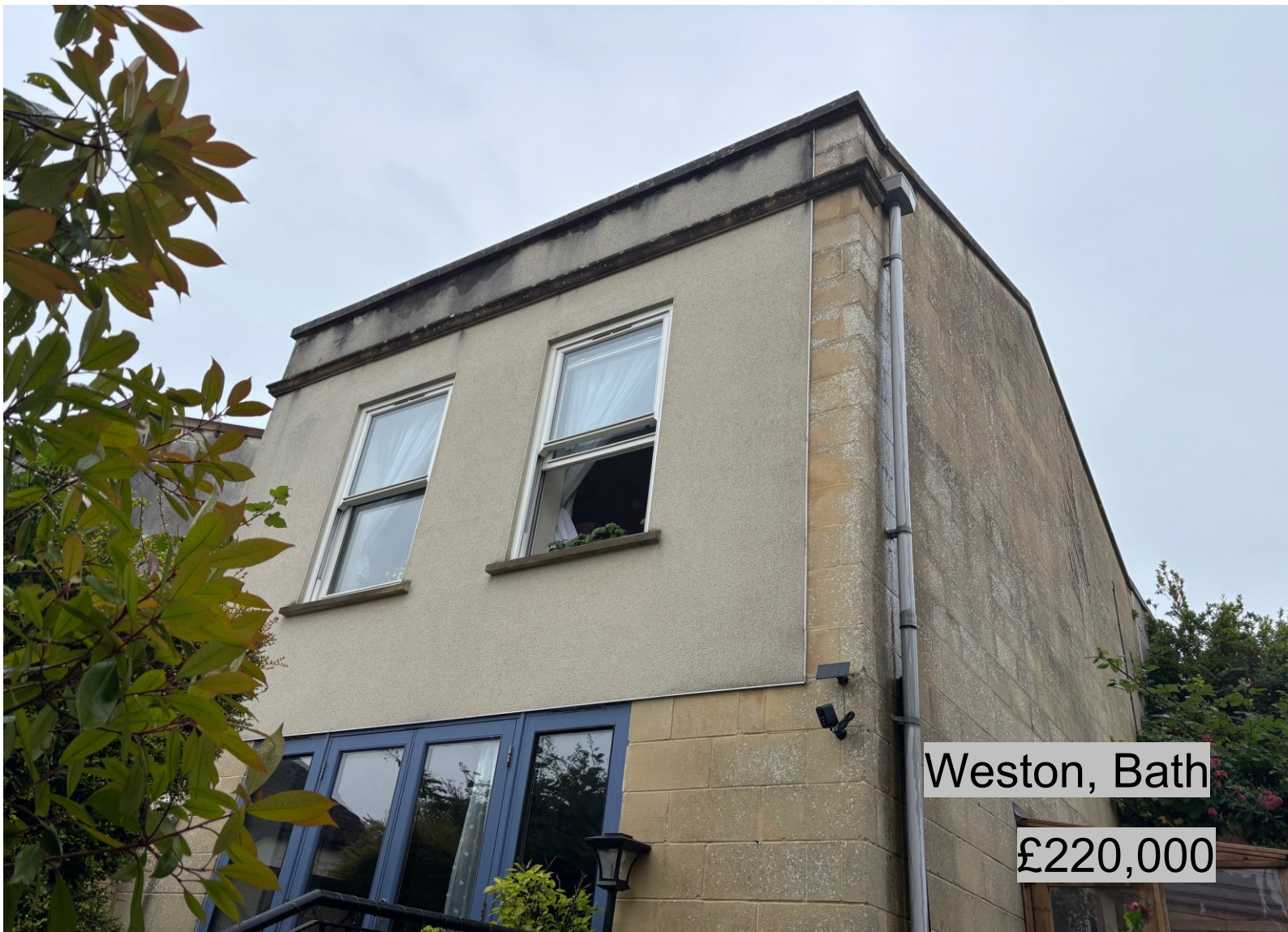
Modern One Bedroom Apartment. Courtyard. Garage. EPC Grade C