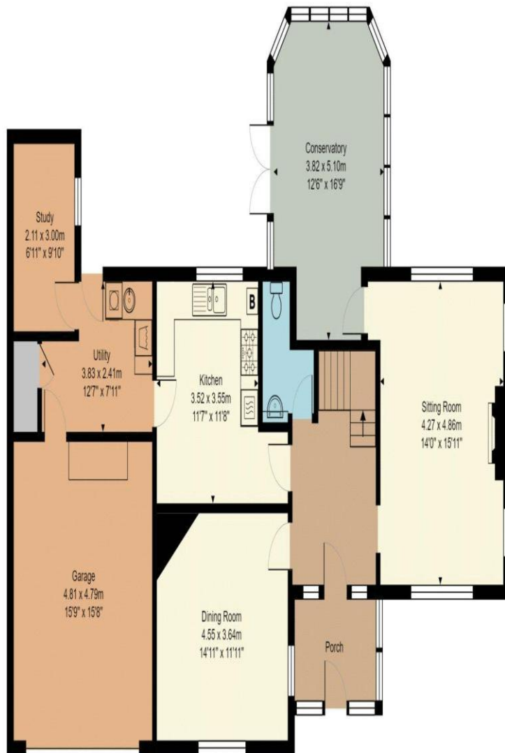
Ground Floor Area: 107.6 m 2 ... 1159 ft 2