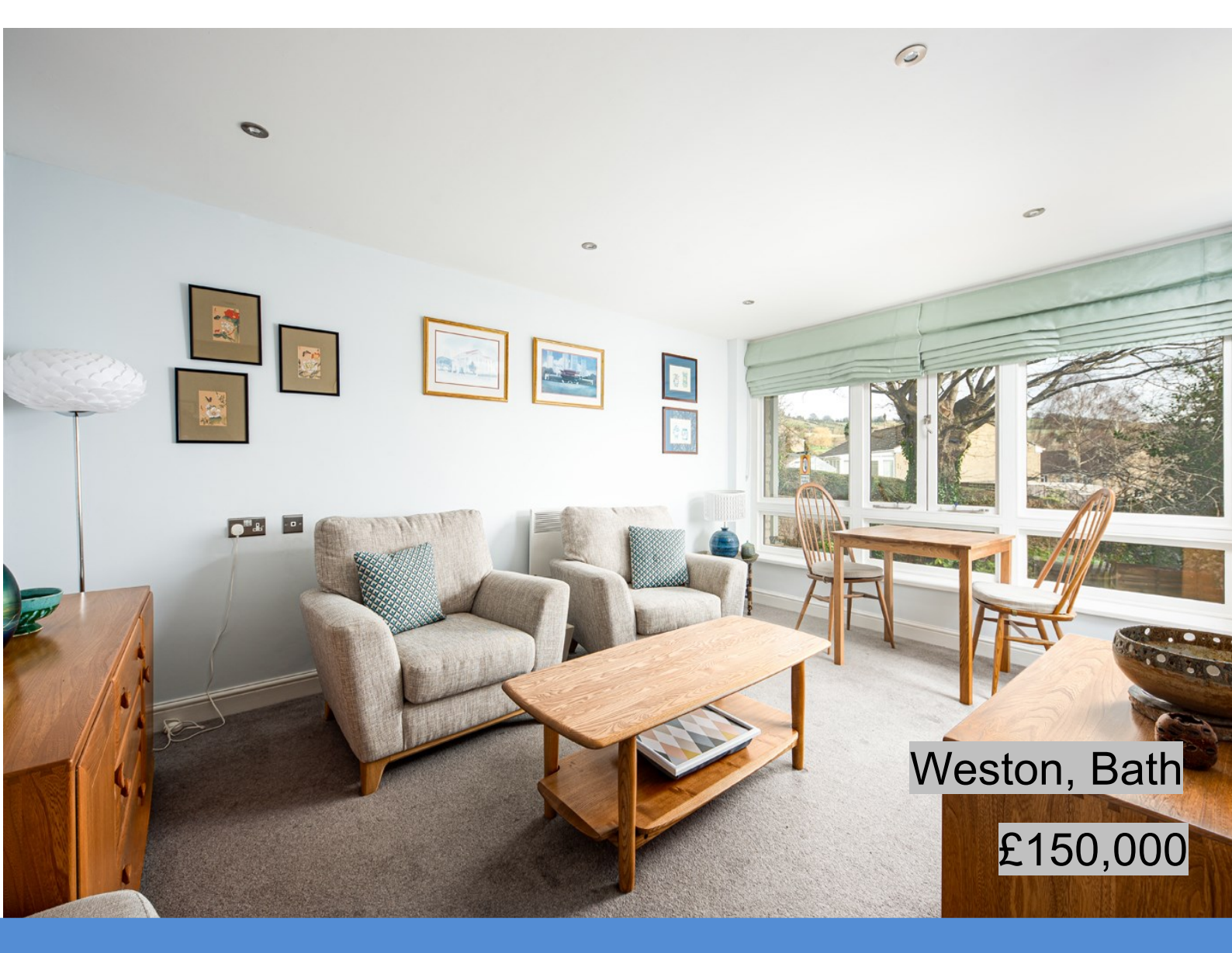
Spacious, Two Bedroom Retirement Apartment with Private Balcony. EPC Grade D