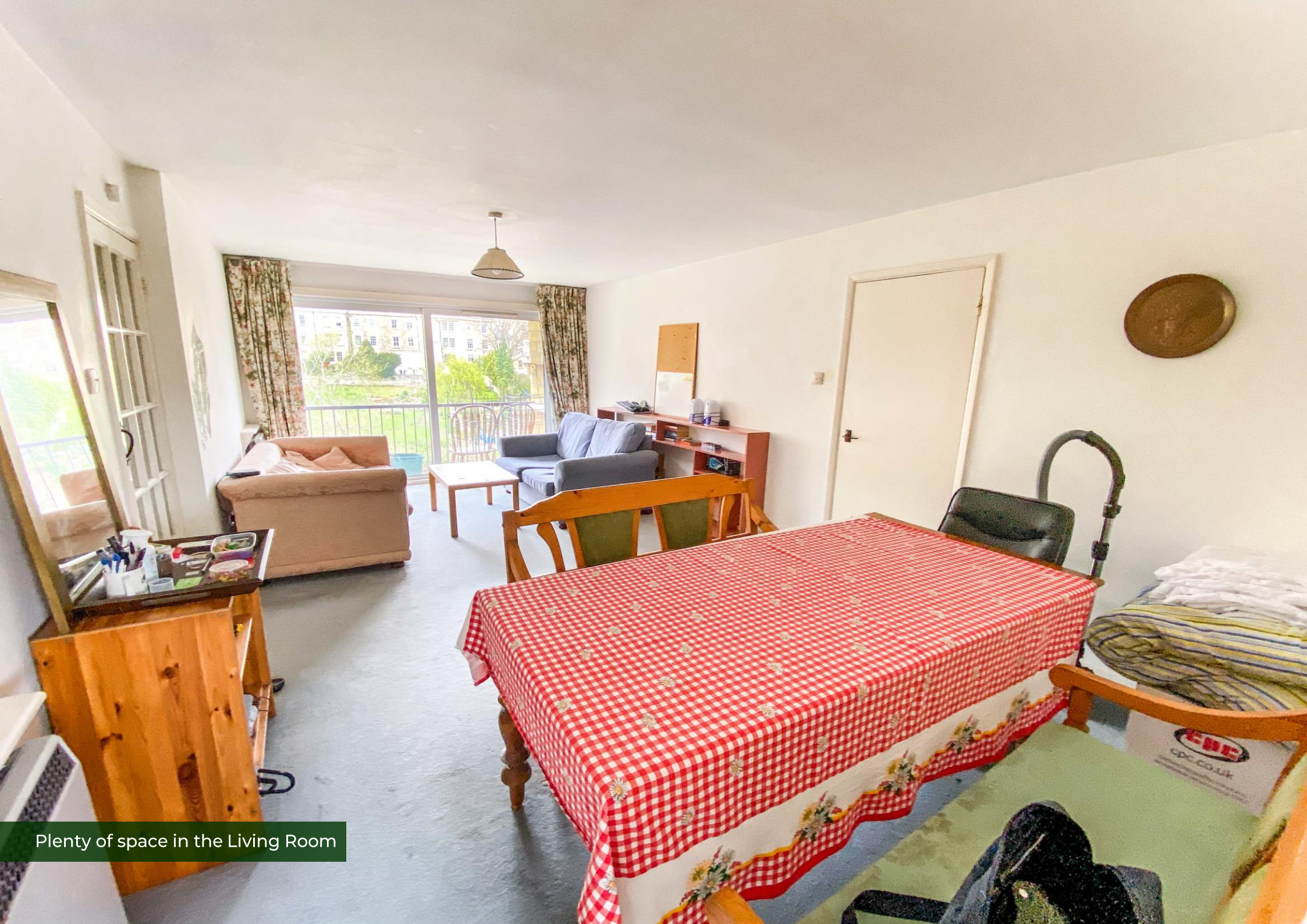
Plenty of space in the Living Room