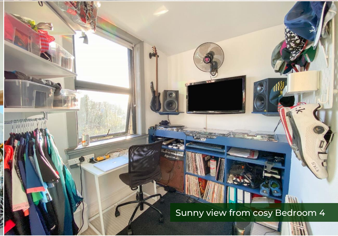
Sunny view from cosy Bedroom 4