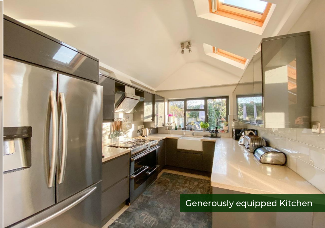
Generously equipped Kitchen