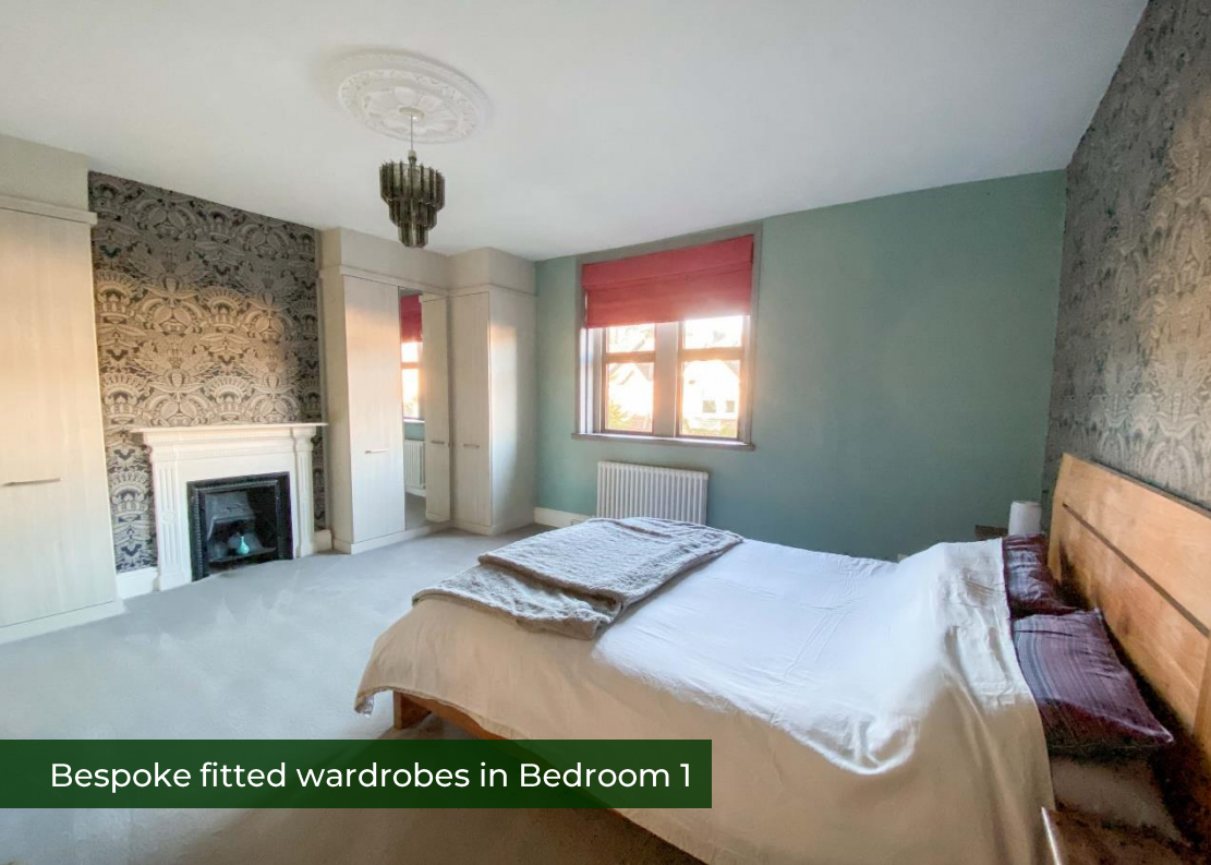
Bespoke fitted wardrobes in Bedroom 1