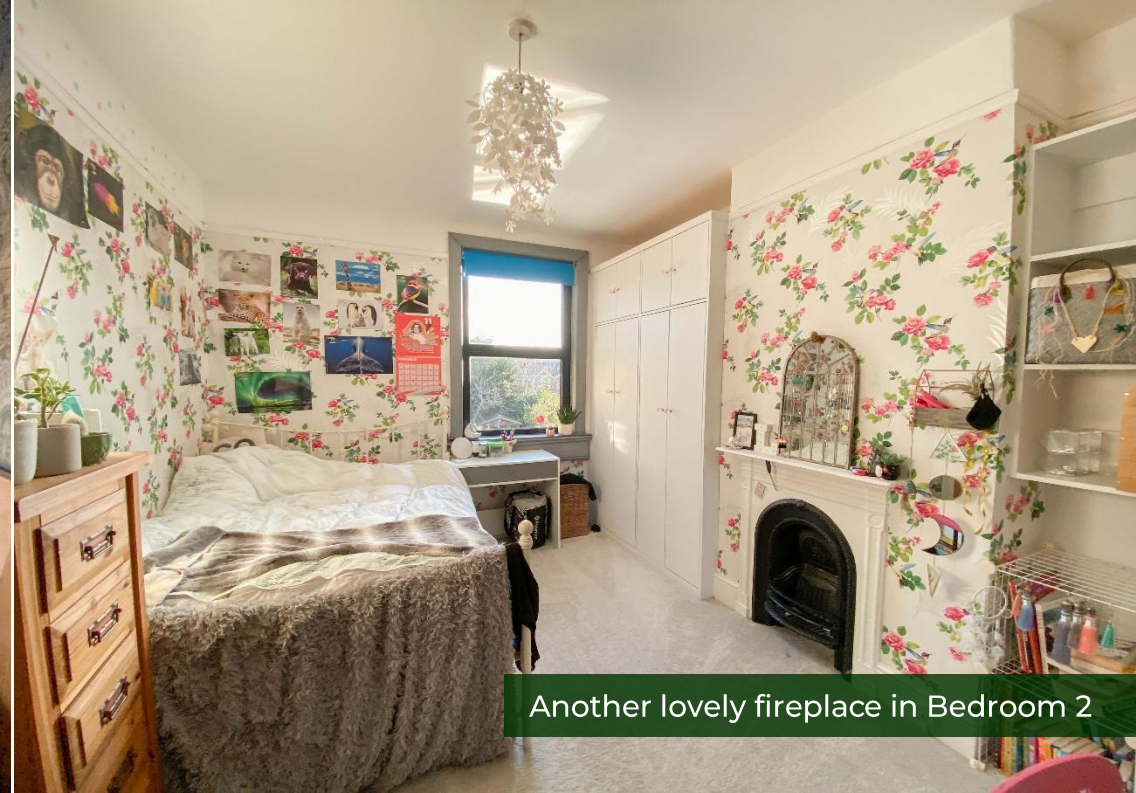
Another lovely fireplace in Bedroom 2