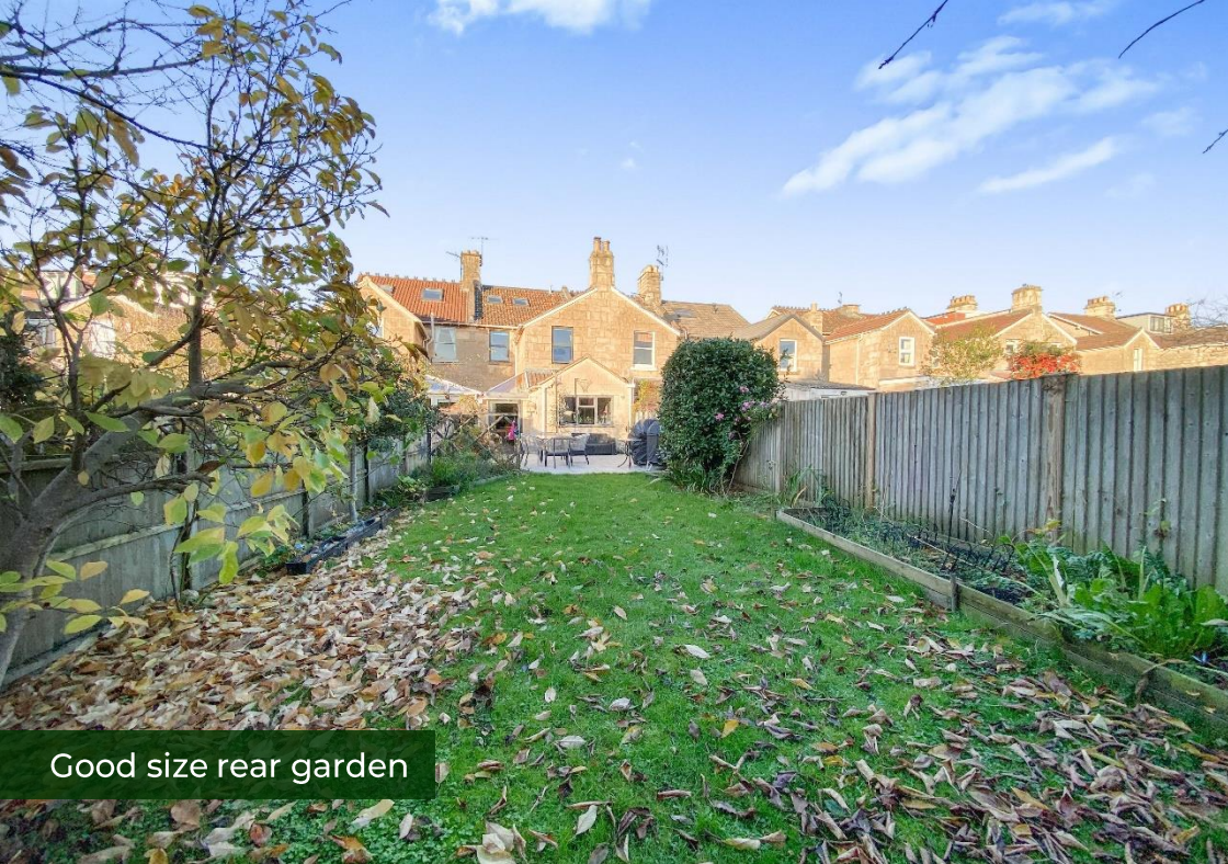
Good size rear garden