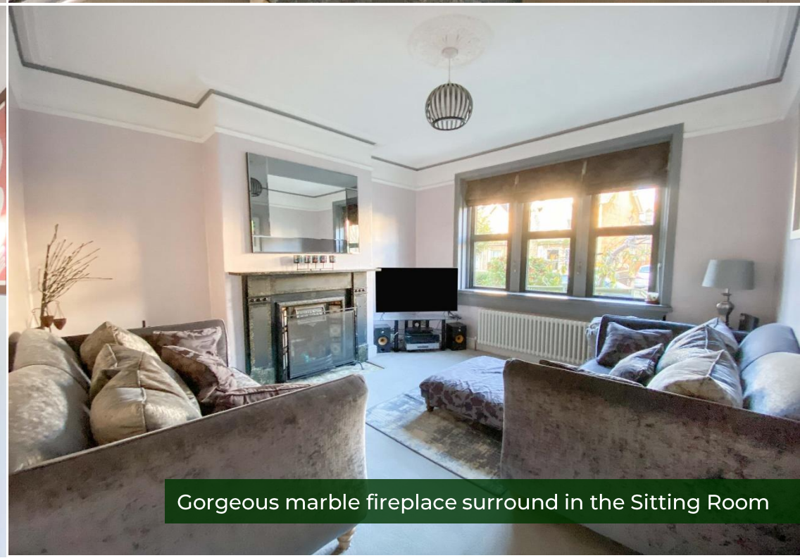
Gorgeous marble fireplace surround in the Sitting Room