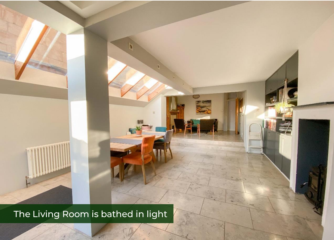
The Living Room is bathed in light