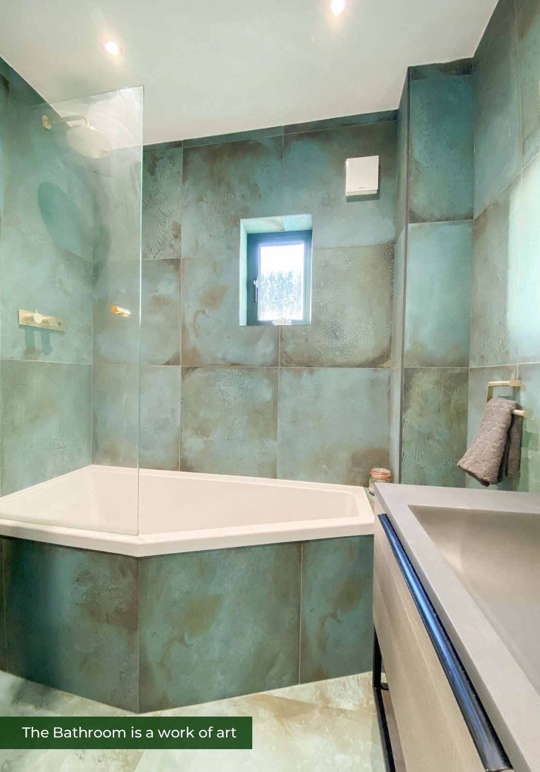
The Bathroom is a work of art