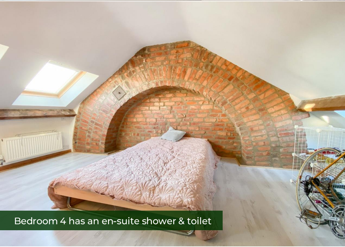
Bedroom 4 has an en-suite shower & toilet