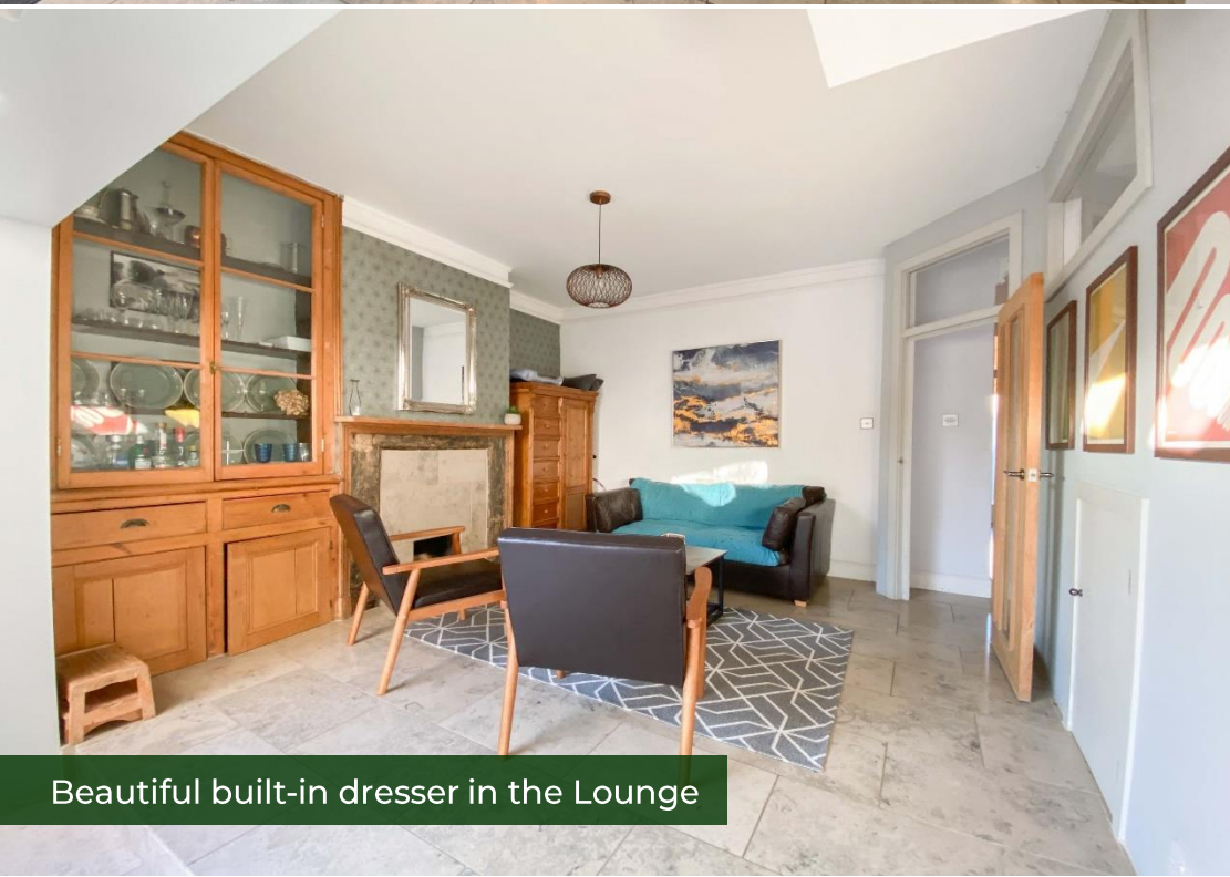
Beautiful built-in dresser in the Lounge