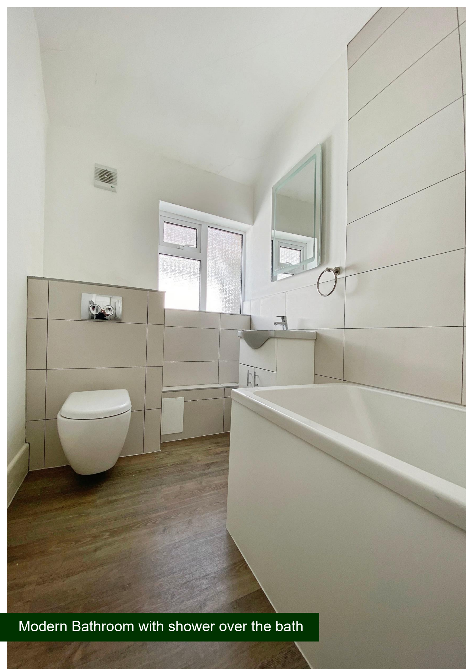
Modern Bathroom with shower over the bath