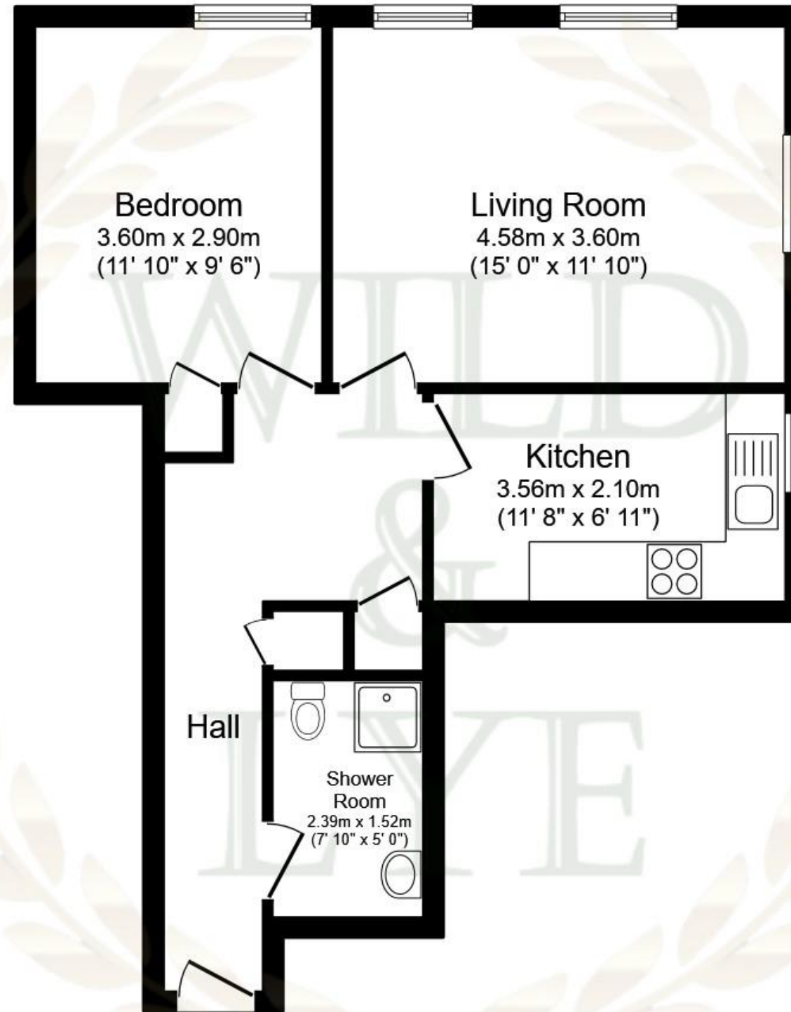
Second Floor Floor area 50.2 sq.m. (541 sq.ft.)

Total floor area: 50.2 sq.m. (541 sq.ft.)