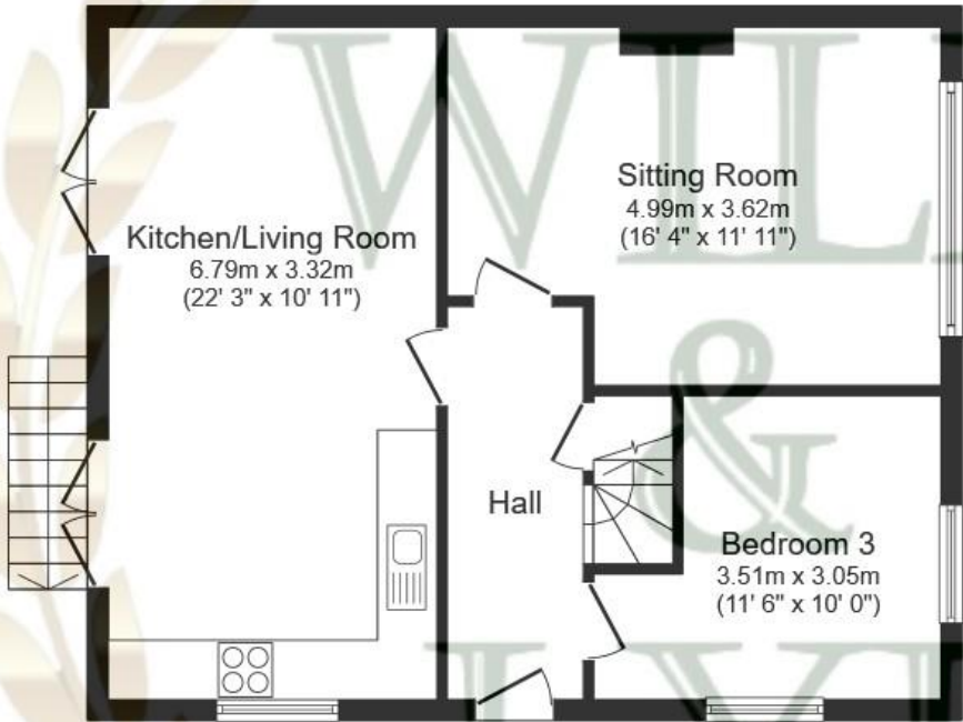
Ground Floor Floor area 57.1 sq.m. (615 sq.ft.)