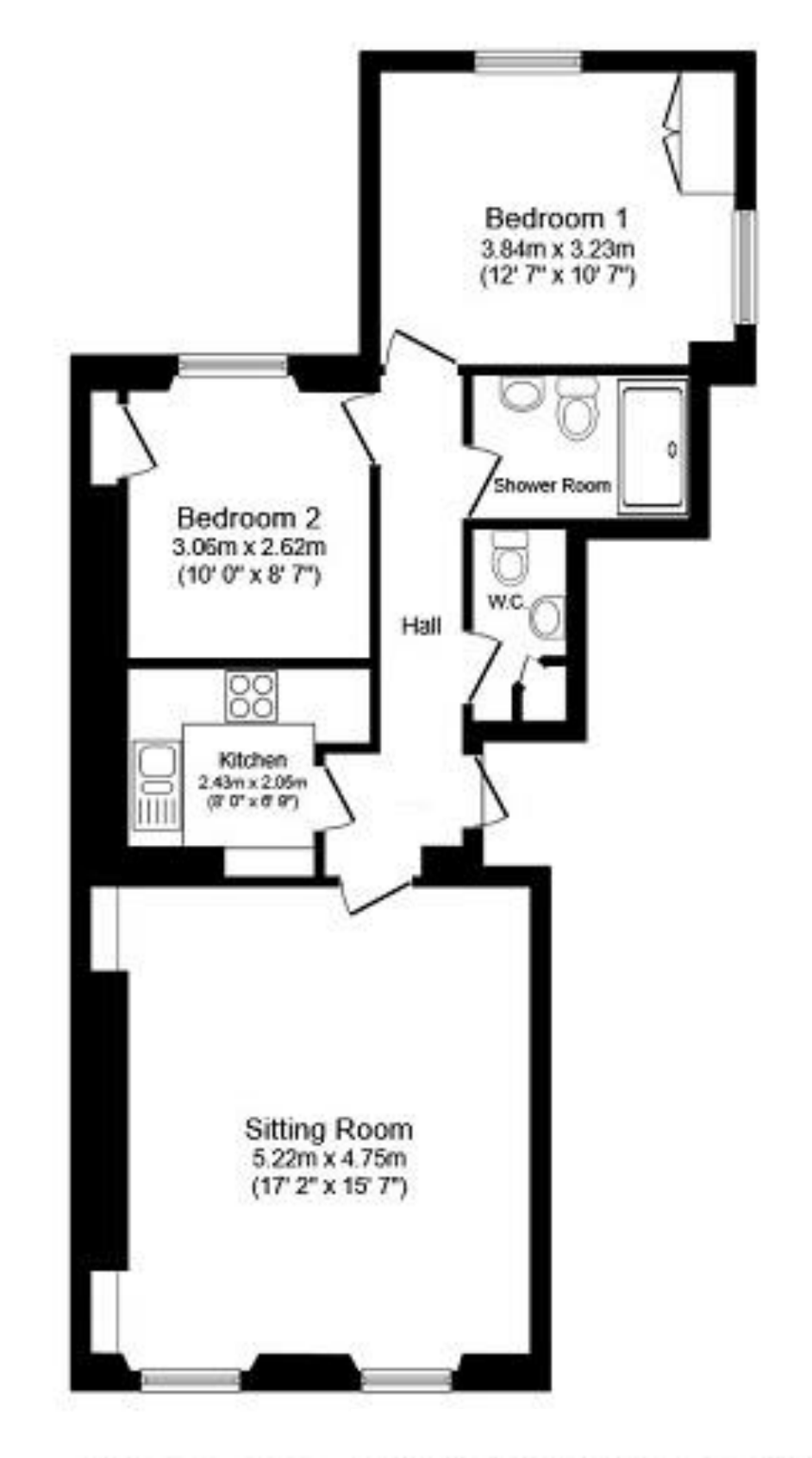
Floor area 65.4 m<sup>2</sup> (704 sq.ft.)