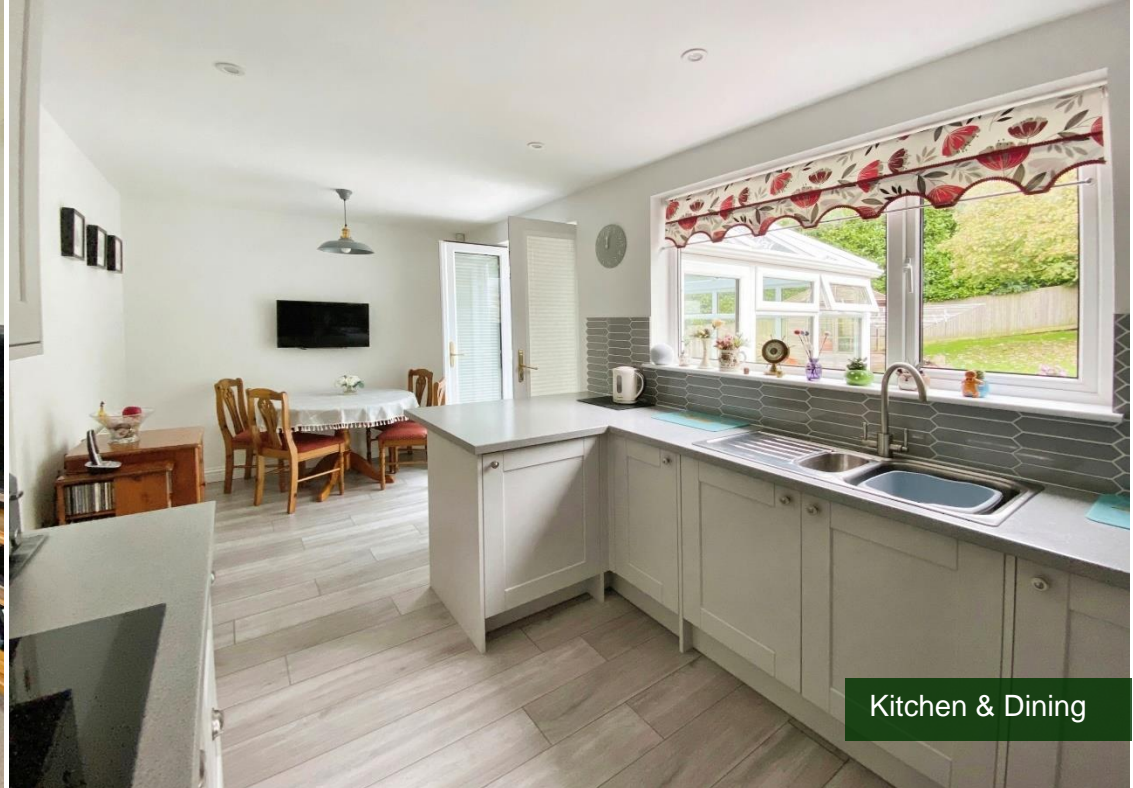
Kitchen & Dining