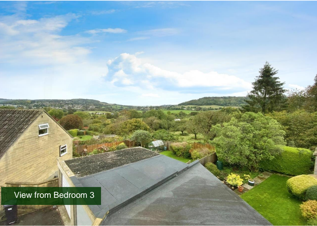
View from Bedroom 3