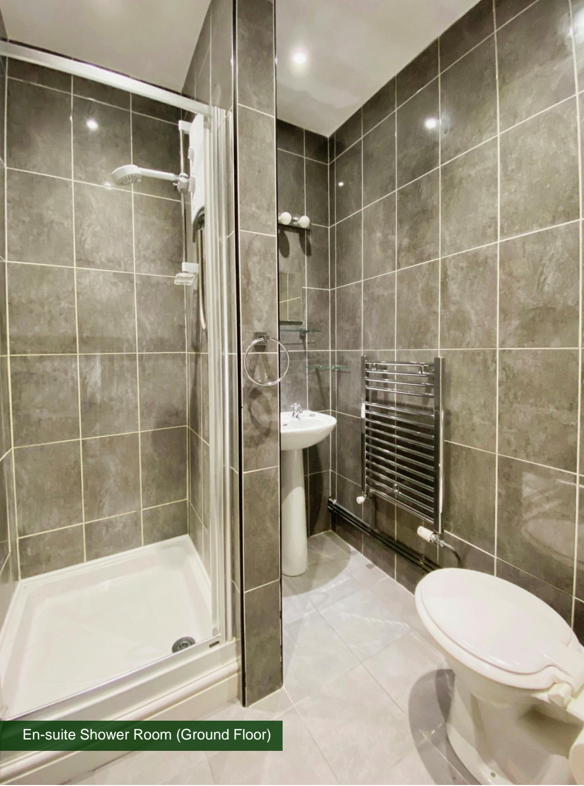
En-suite Shower Room (Ground Floor)