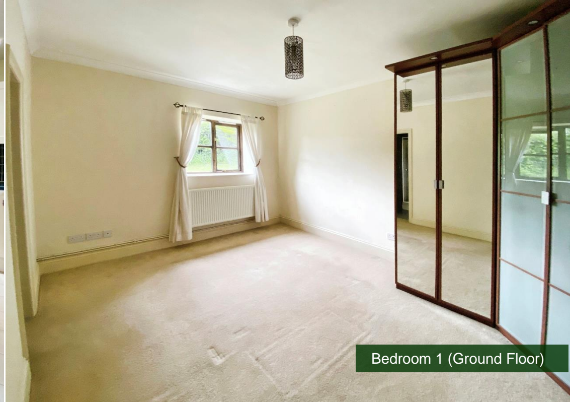
Bedroom 1 (Ground Floor)