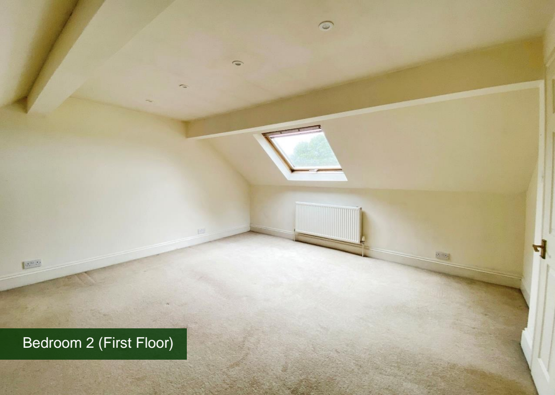
Bedroom 2 (First Floor)