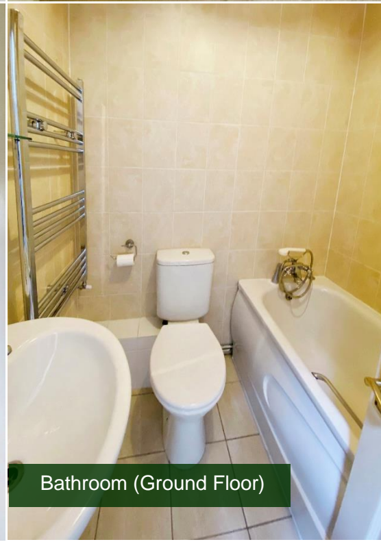
Bathroom (Ground Floor)