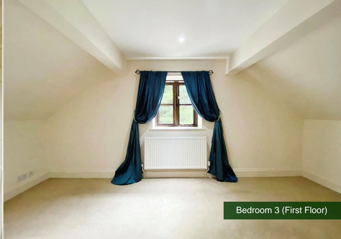
Bedroom 3 (First Floor)