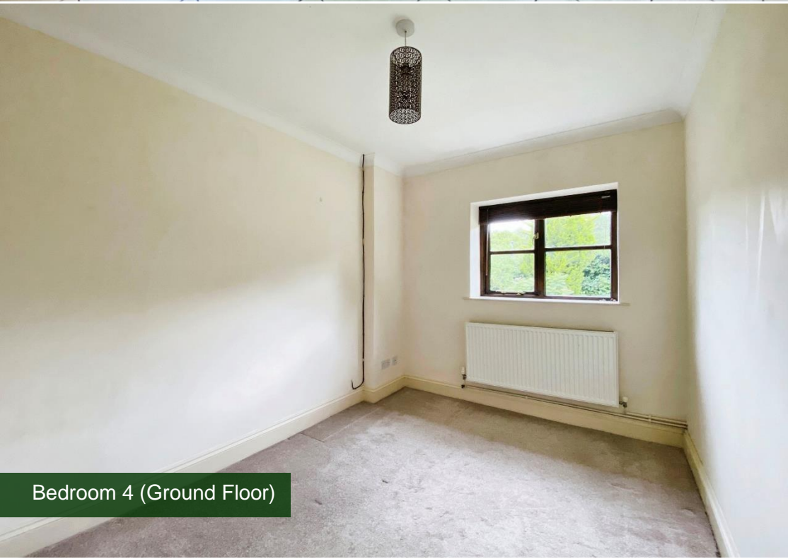
Bedroom 4 (Ground Floor)