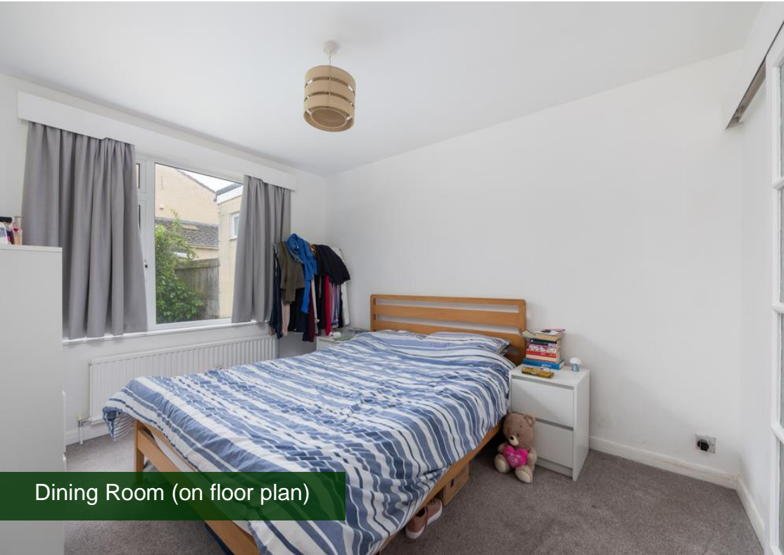
Dining Room (on floor plan)