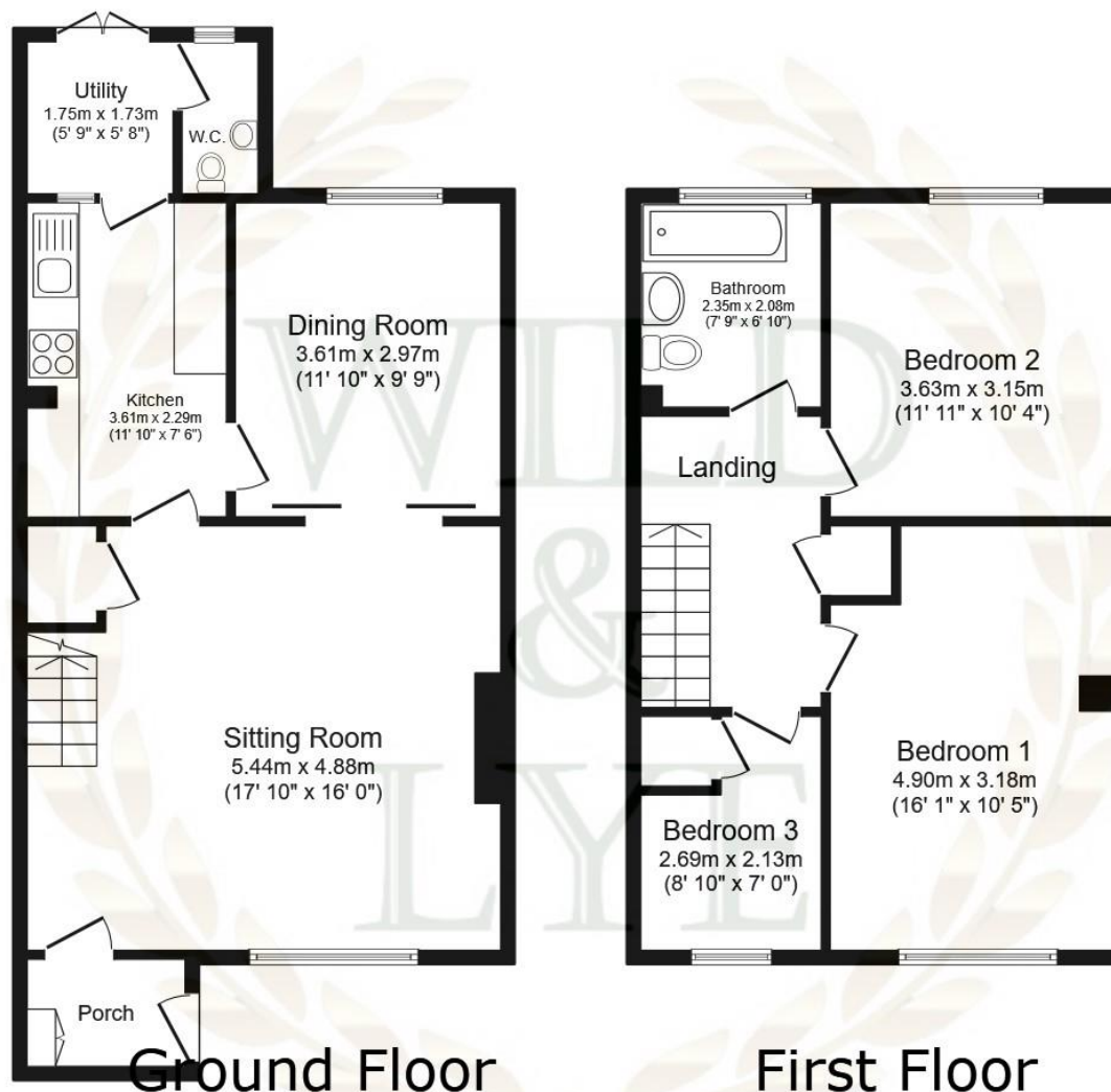
Ground Floor Floor area 54.1 m 2 (582 sq.ft.) First Floor Floor area 46.7 m 2 (503 sq.ft.)