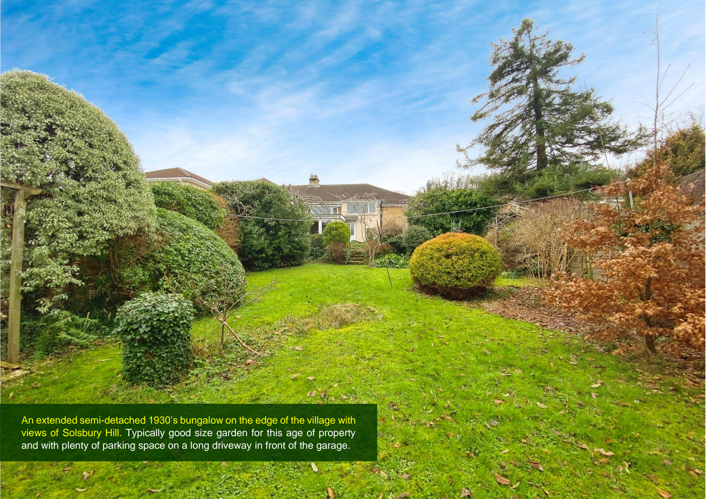
An extended semi-detached 1930's bungalow on the edge of the village with views of Solsbury Hill. Typically good size garden for this age of property and with plenty of parking space on a long driveway in front of the garage.