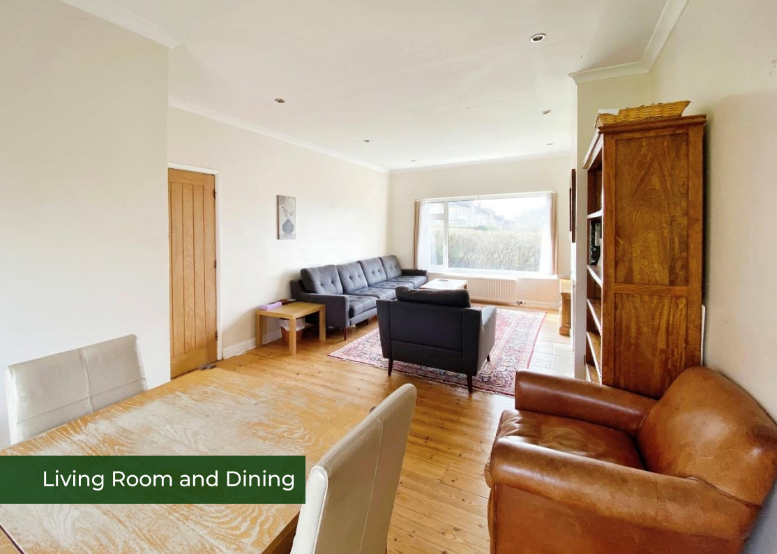
Living Room and Dining