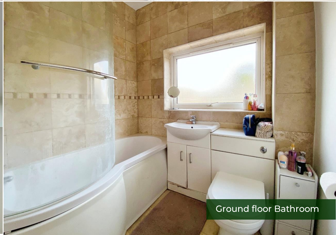
Ground floor Bathroom