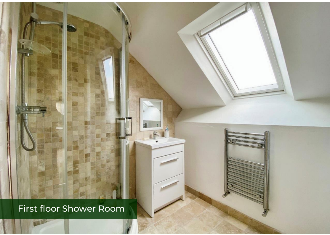
First floor Shower Room