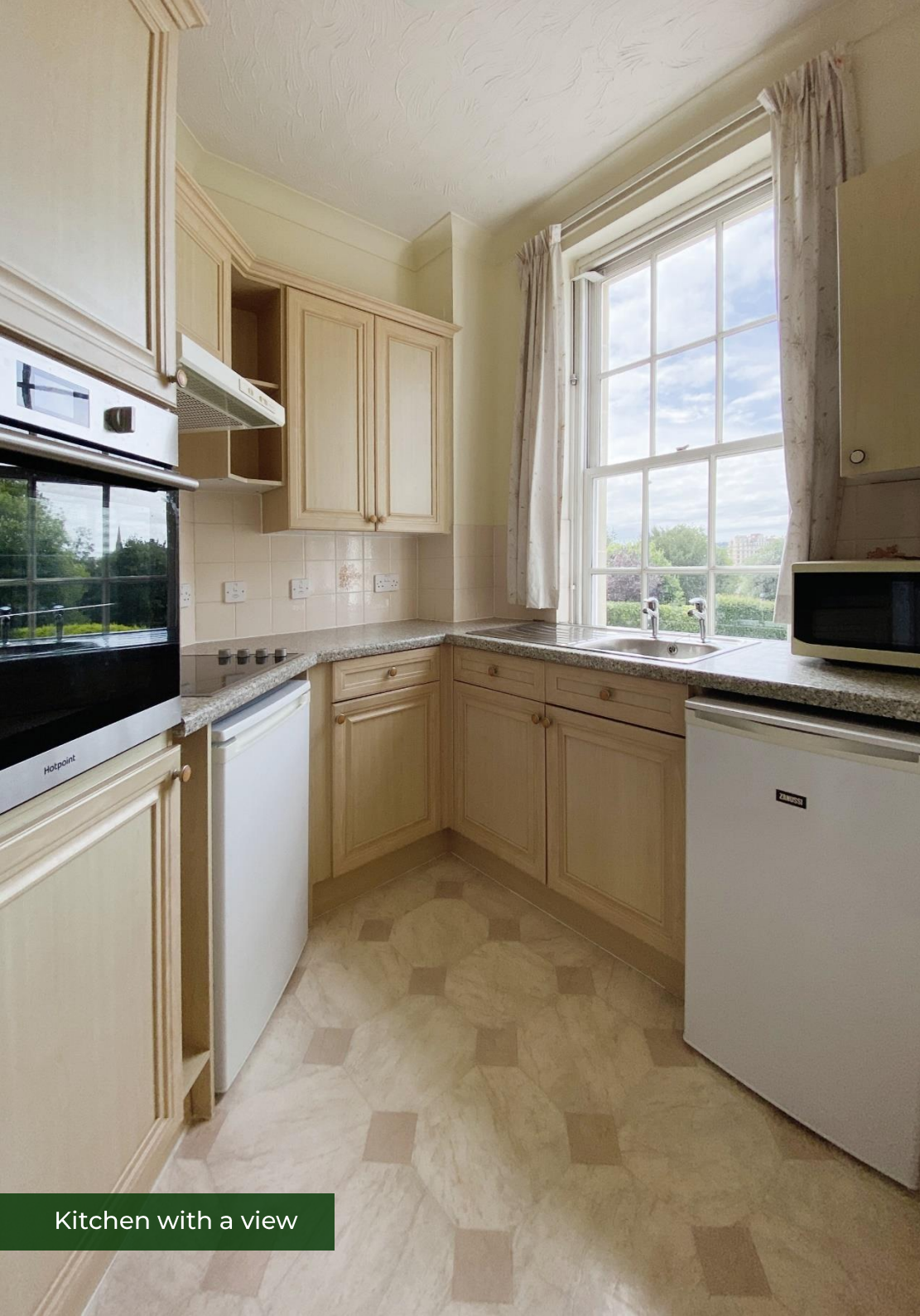
Kitchen with a view