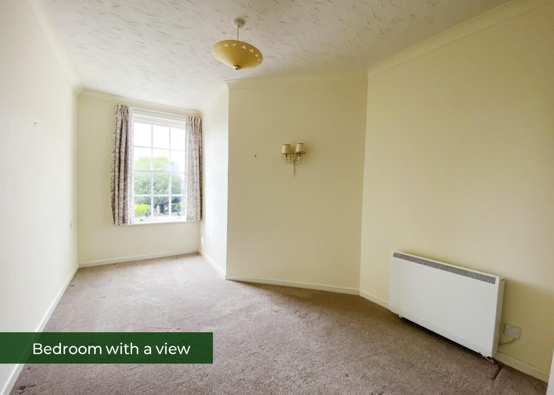
Bedroom with a view