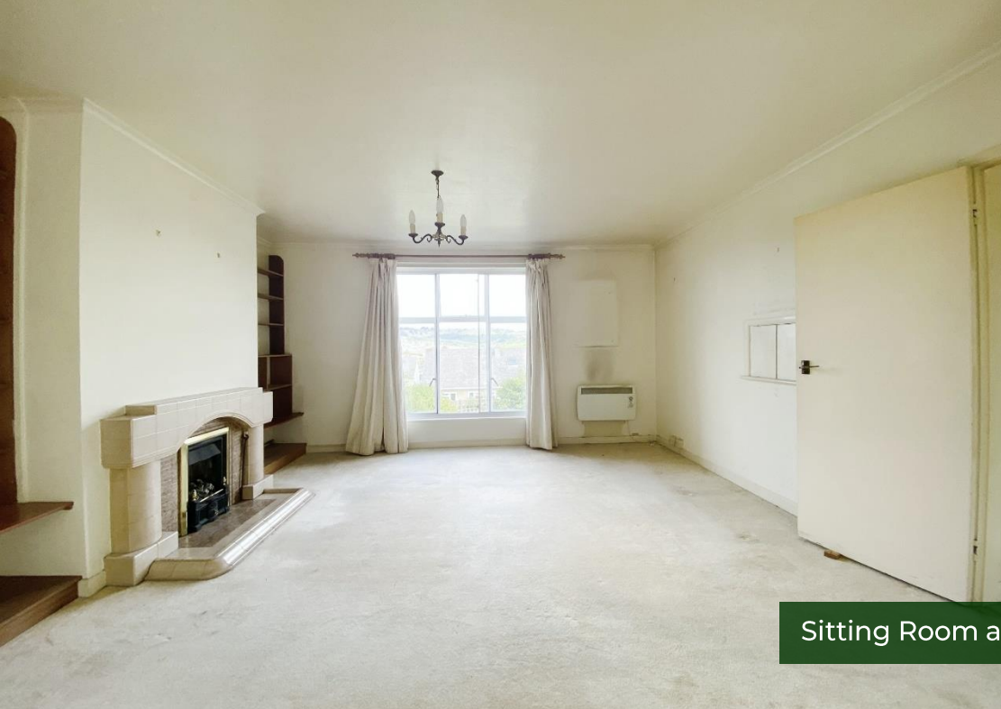
Sitting Room and Dining Room