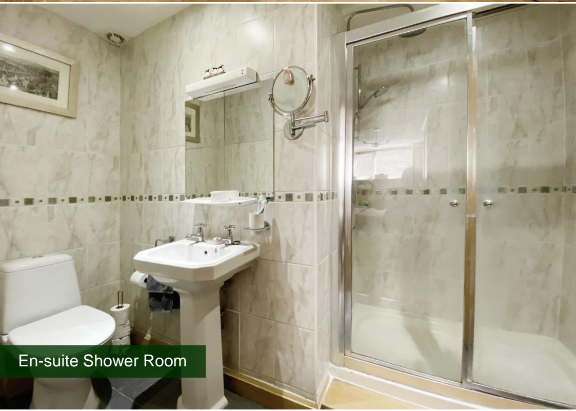
En-suite Shower Room