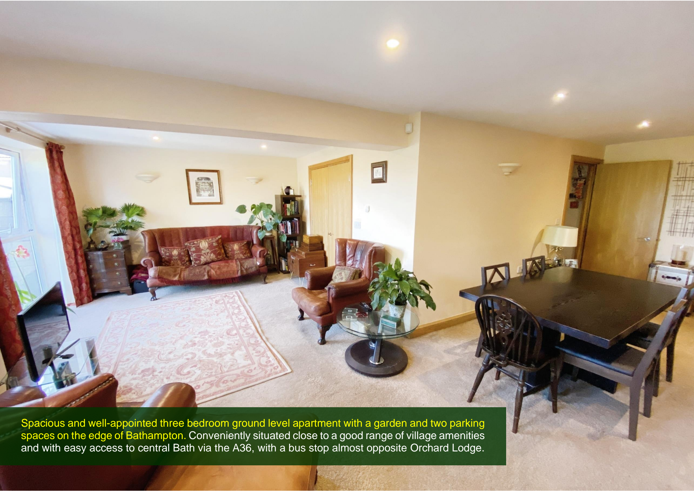
Spacious and well-appointed three bedroom ground level apartment with a garden and two parking spaces on the edge of Bathampton. Conveniently situated close to a good range of village amenities and with easy access to central Bath via the A36, with a bus stop almost opposite Orchard Lodge.