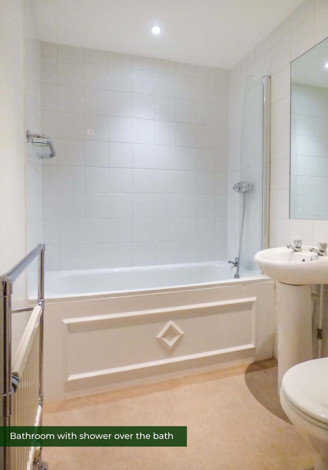
Bathroom with shower over the bath