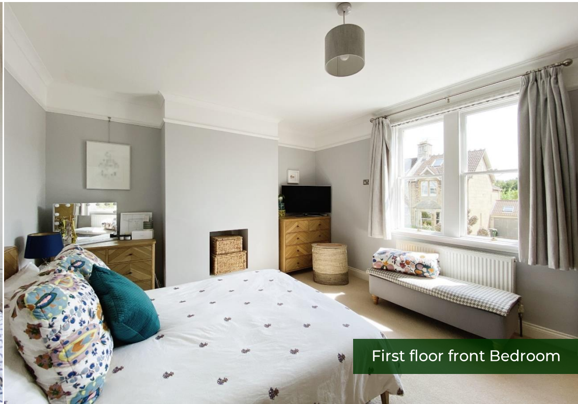
First floor front Bedroom