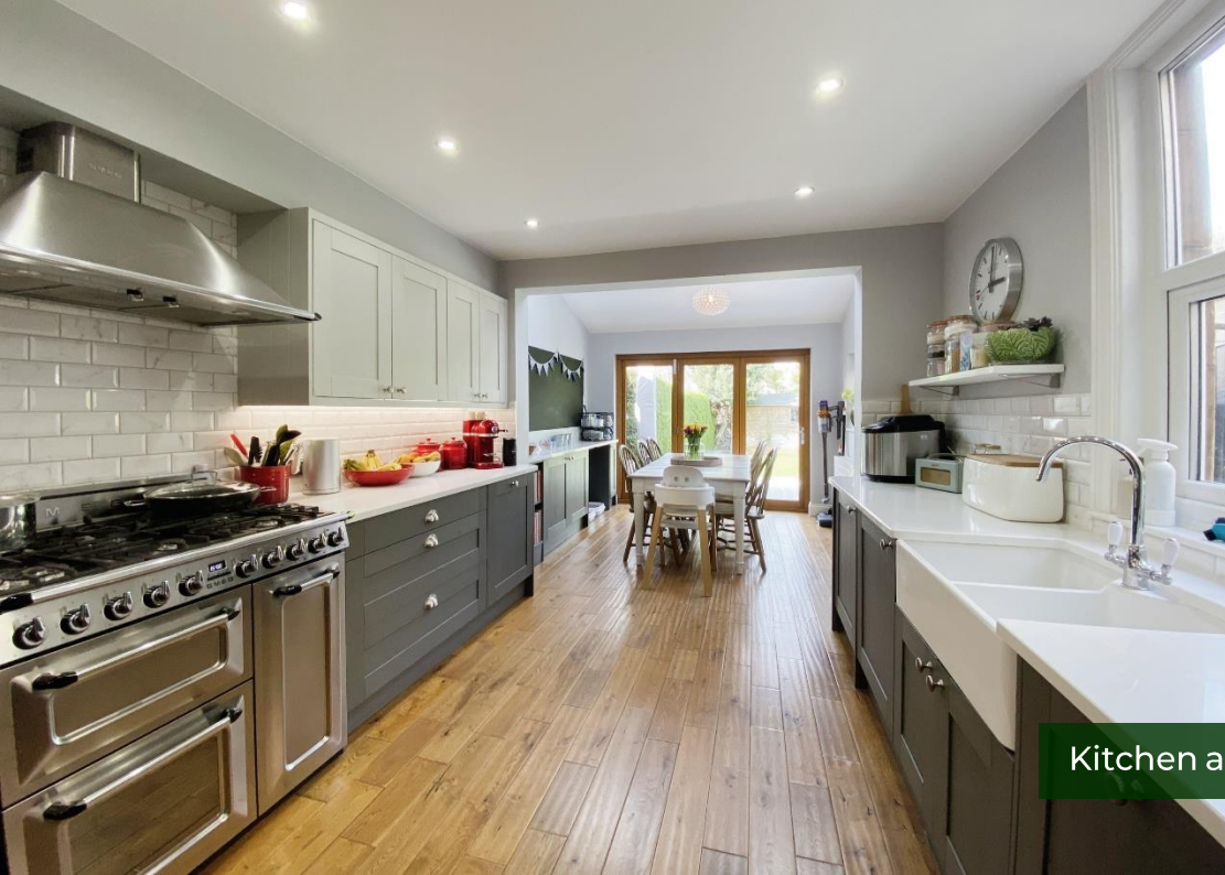
Kitchen and Dining