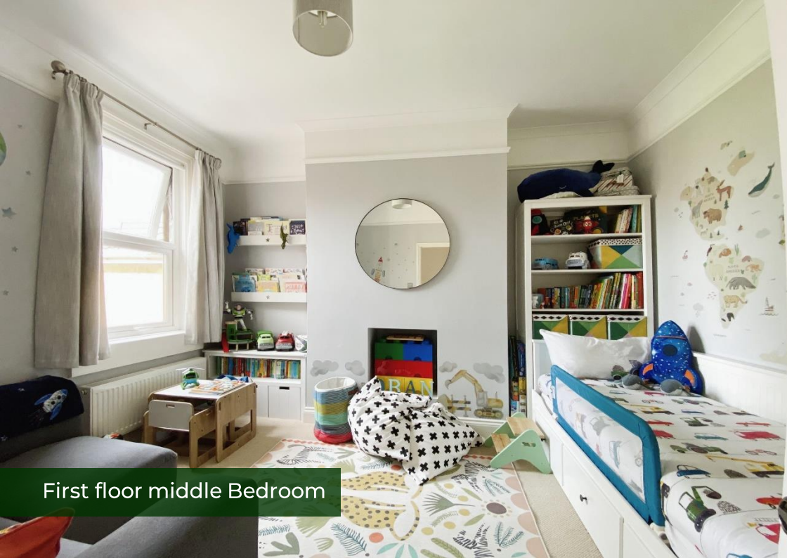
First floor middle Bedroom