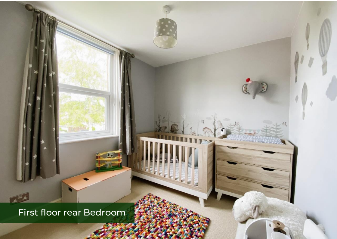
First floor rear Bedroom