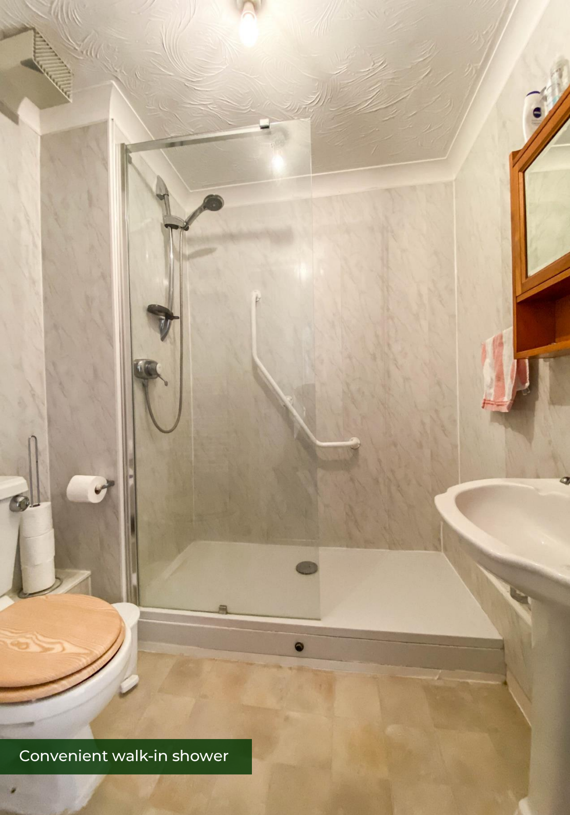
Convenient walk-in shower