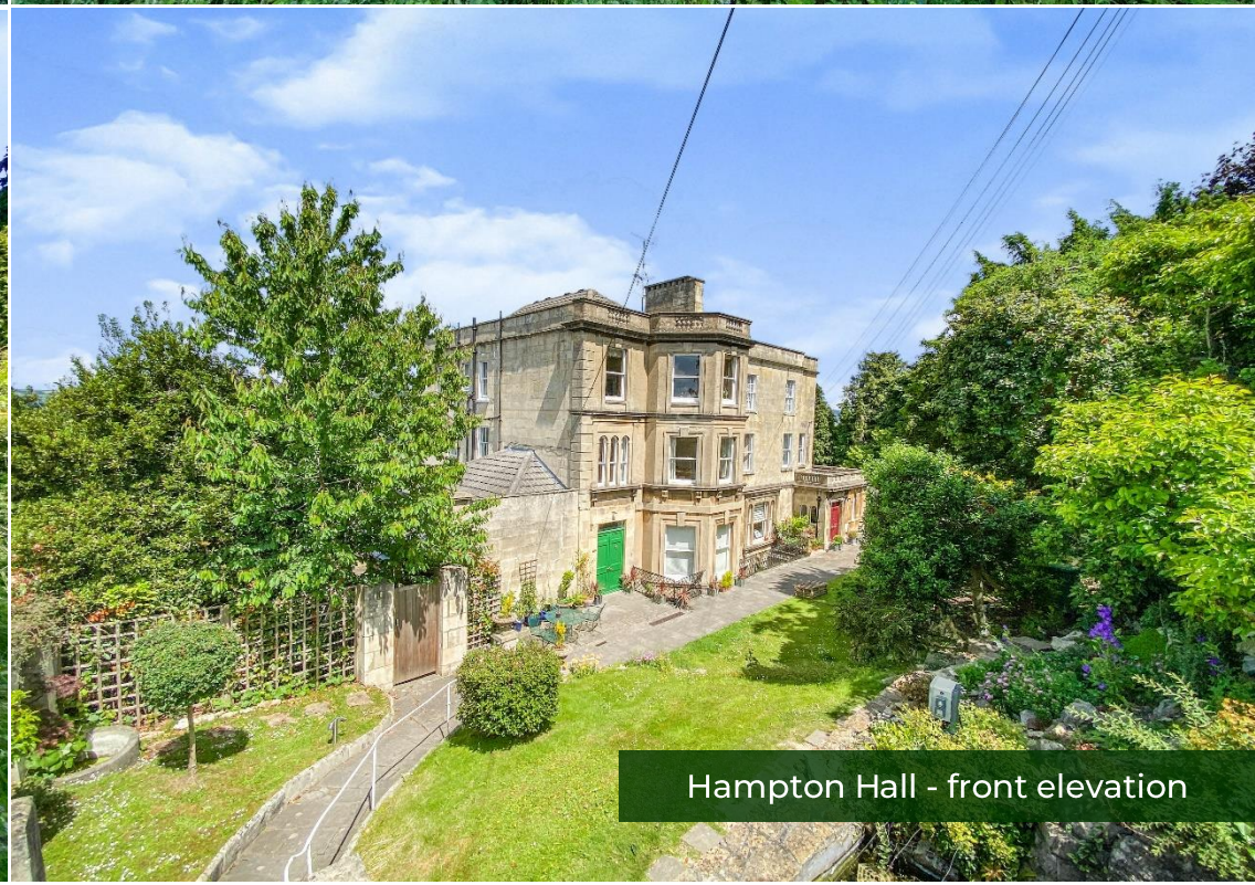
Hampton Hall - front elevation