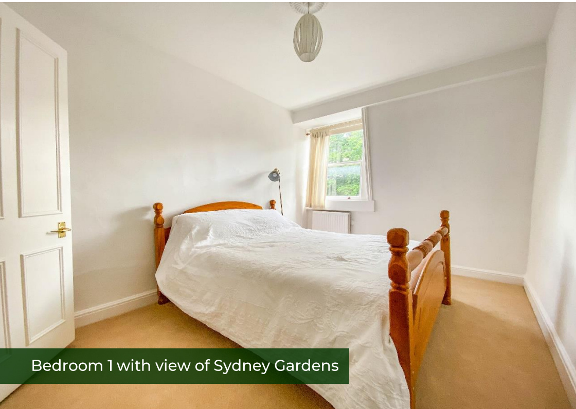
Bedroom 1 with view of Sydney Gardens