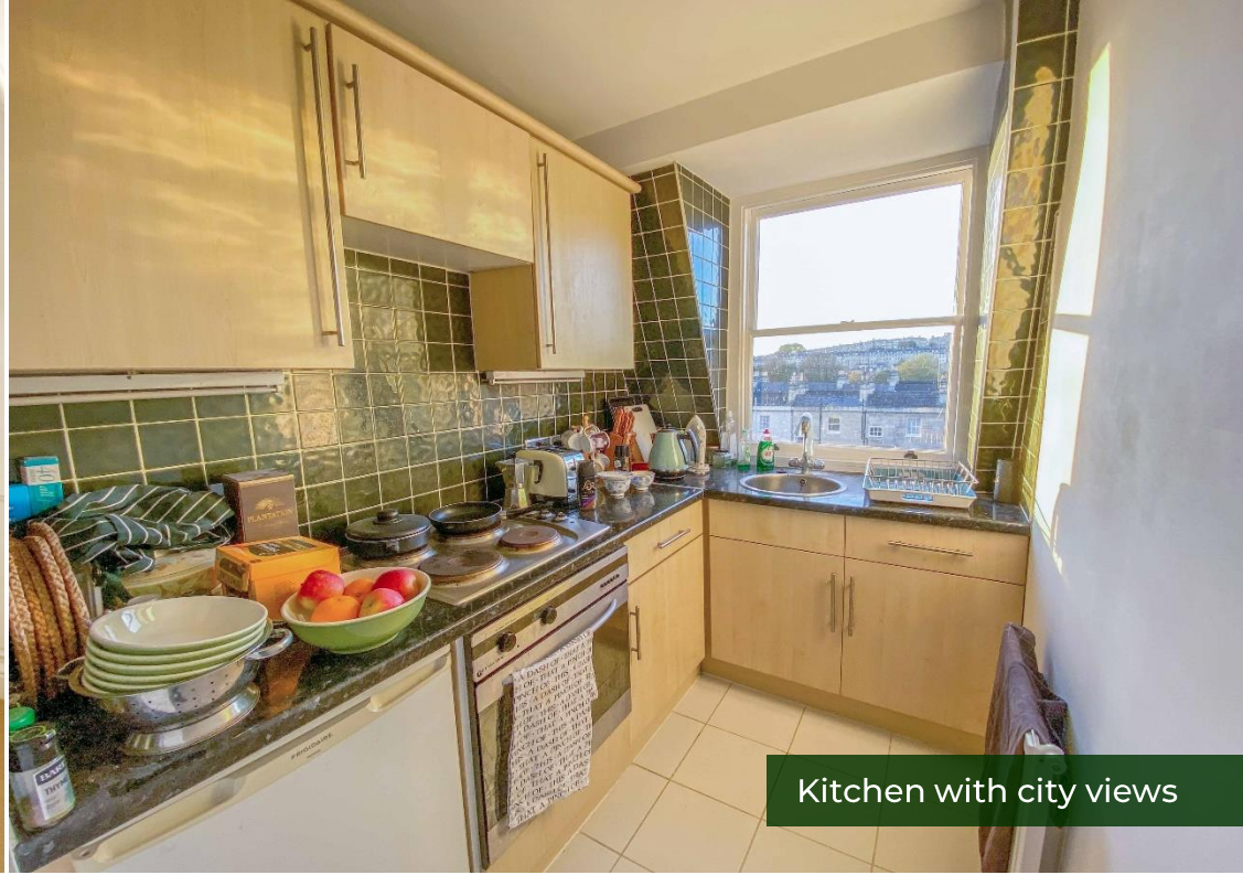
Kitchen with city views