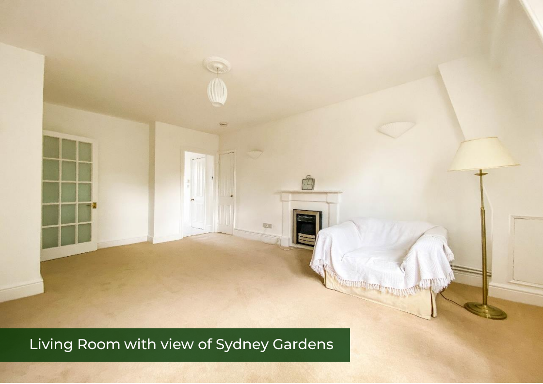
Living Room with view of Sydney Gardens