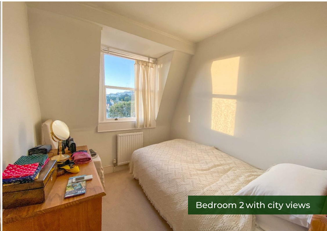
Bedroom 2 with city views