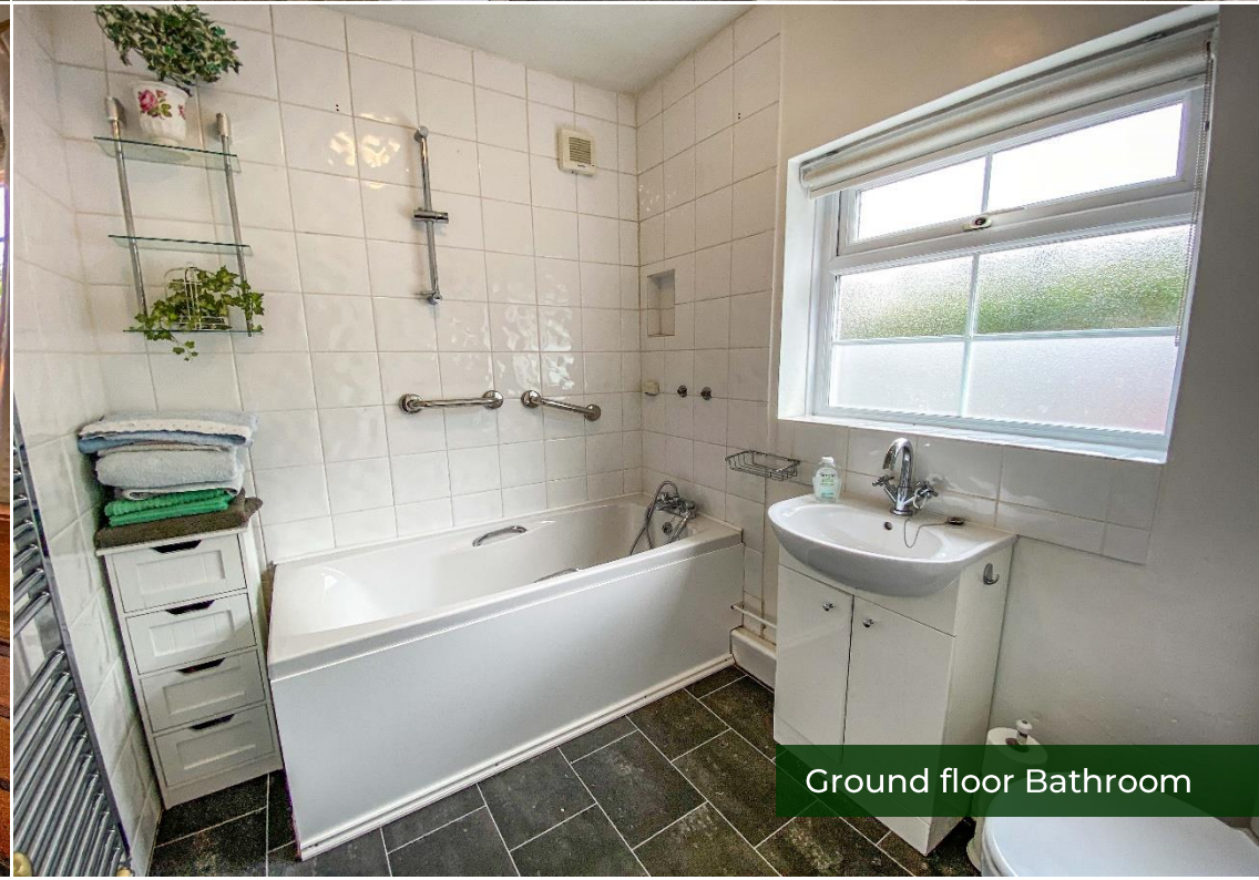
Ground floor Bathroom