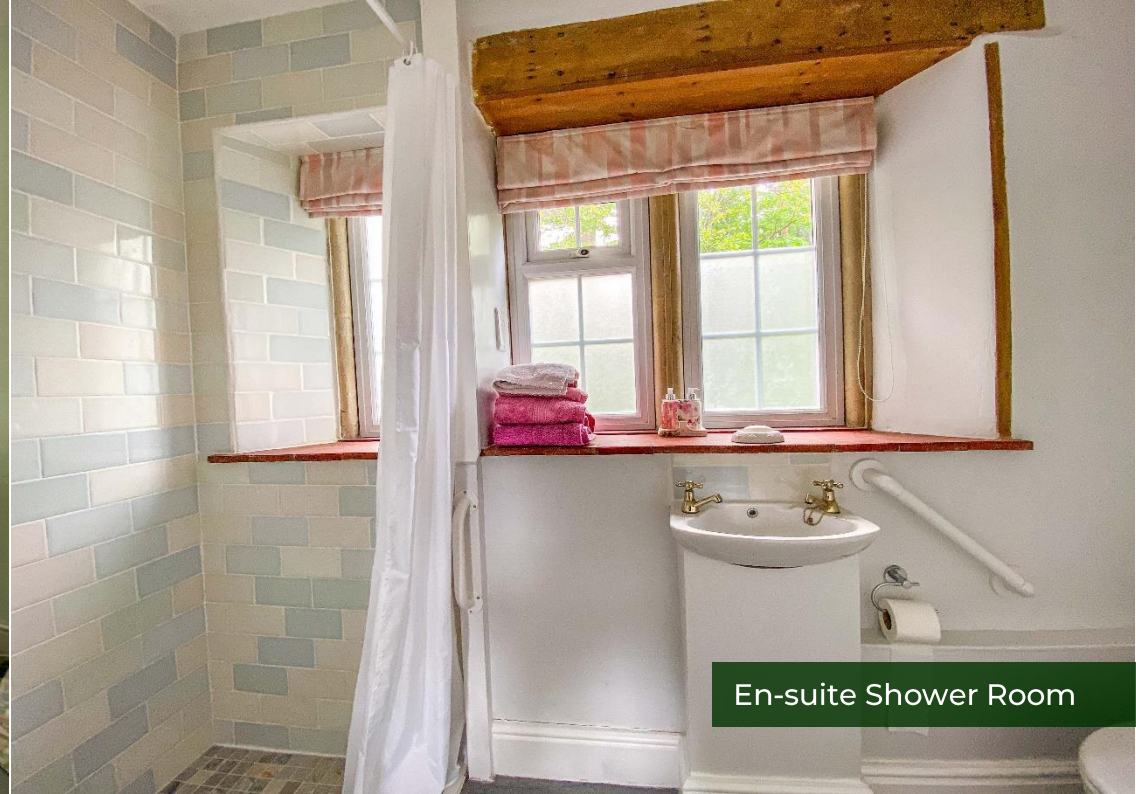
En-suite Shower Room