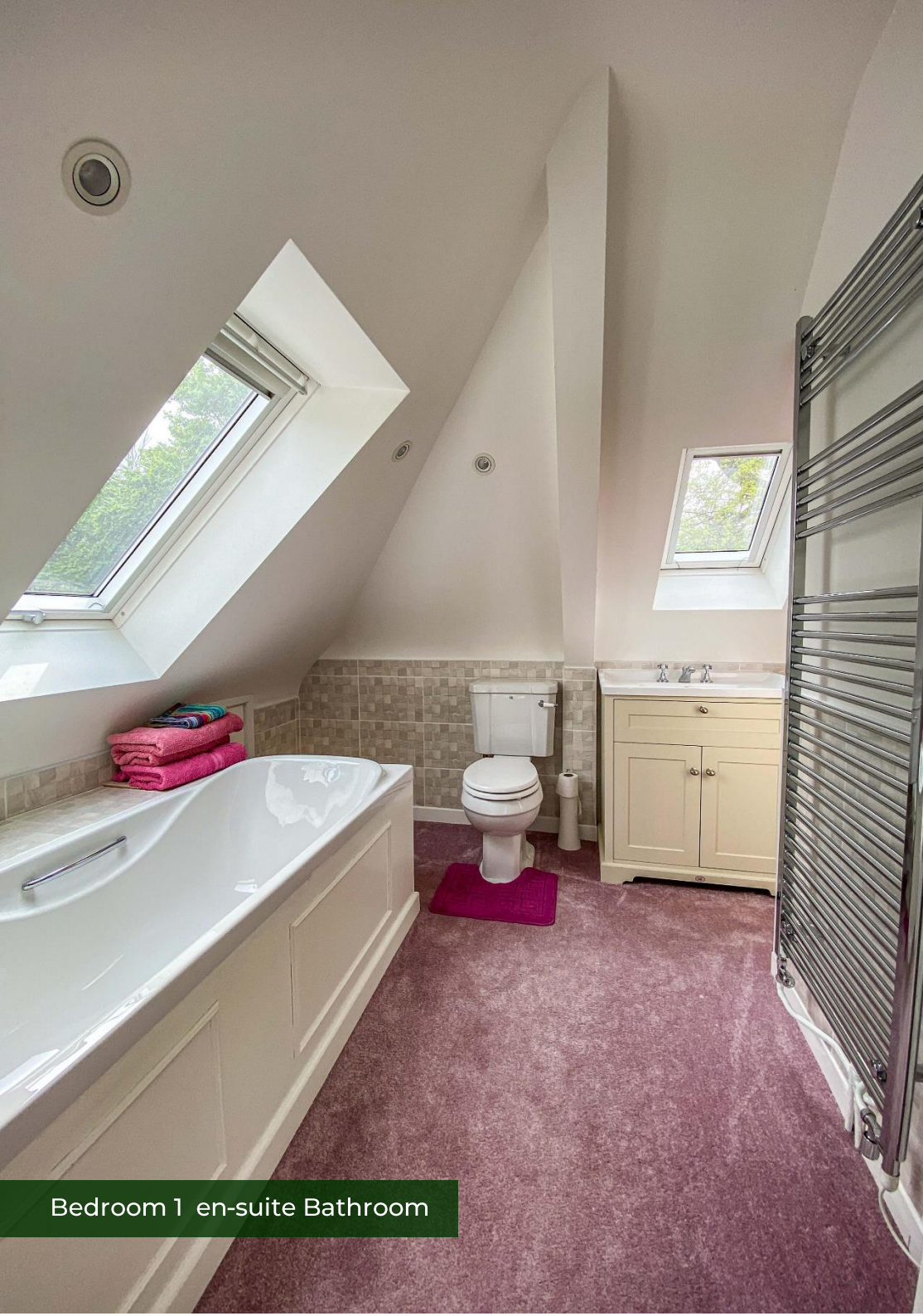
Bedroom 1 en-suite Bathroom