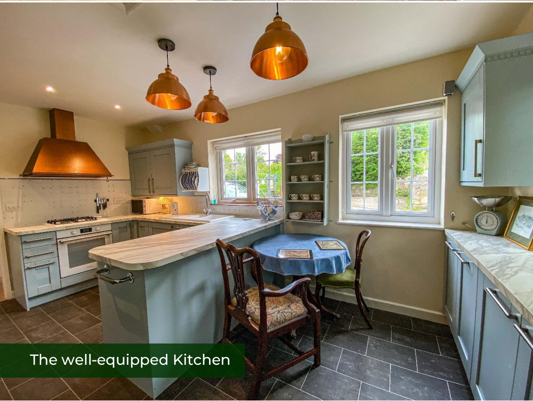
The well-equipped Kitchen