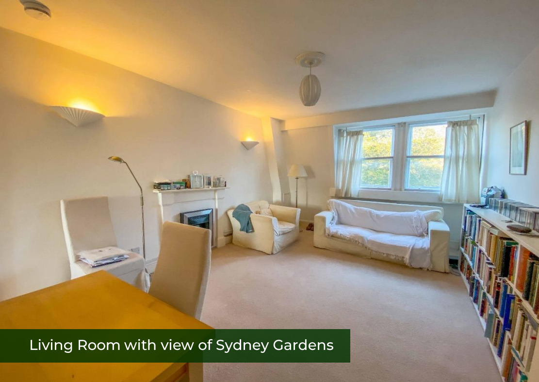
Living Room with view of Sydney Gardens