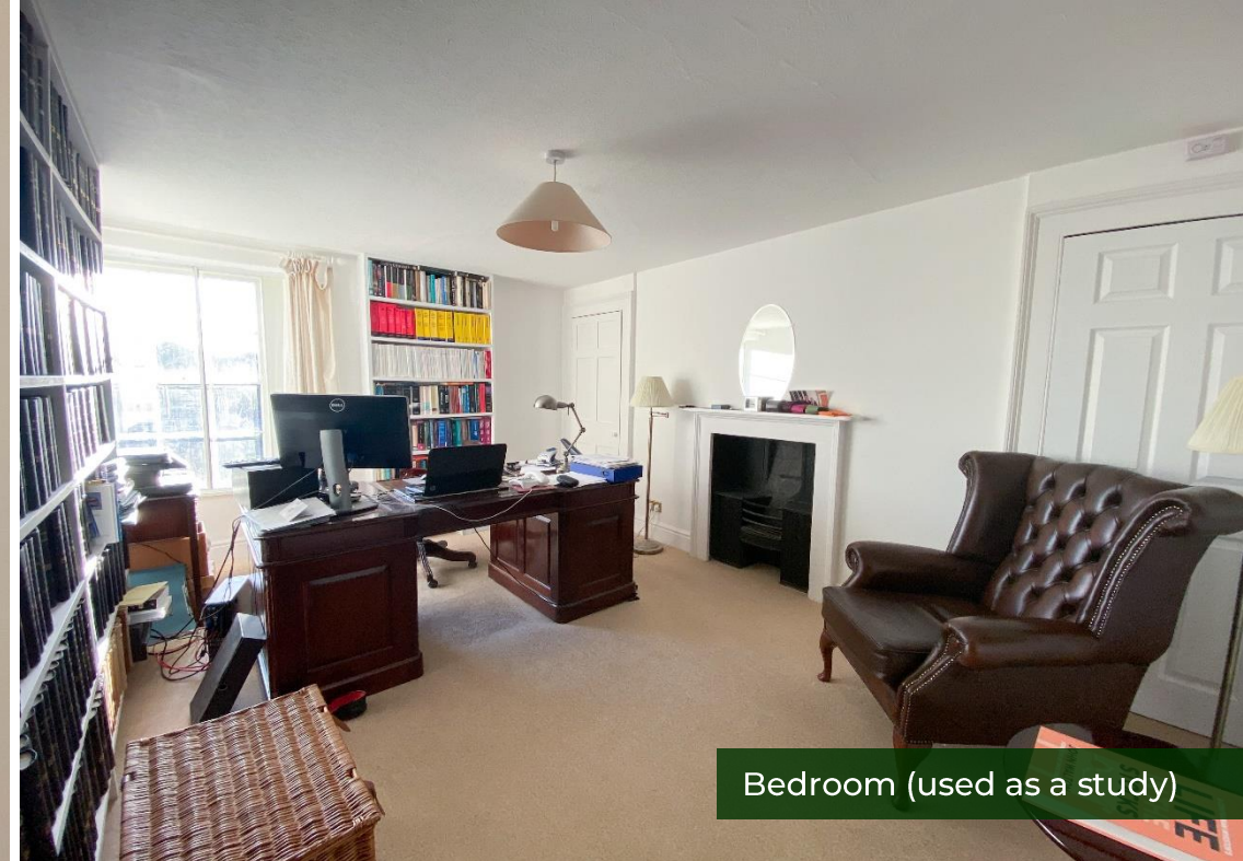
Bedroom (used as a study)