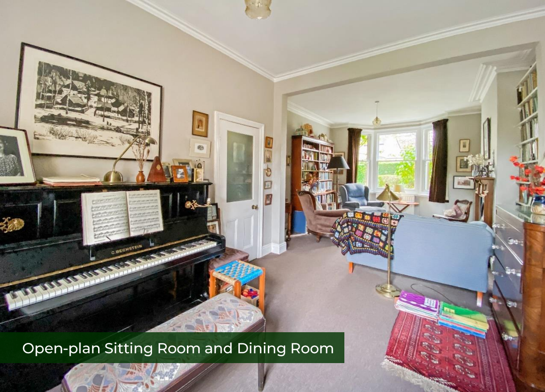
Open-plan Sitting Room and Dining Room