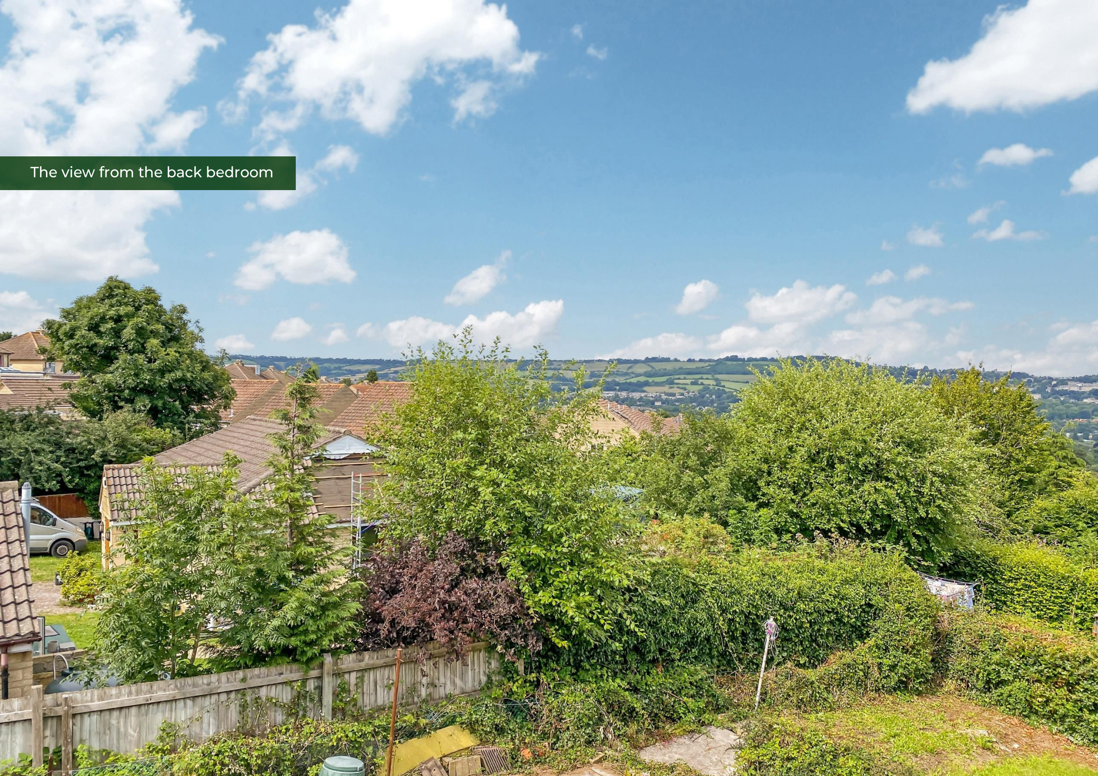
The view from the back bedroom