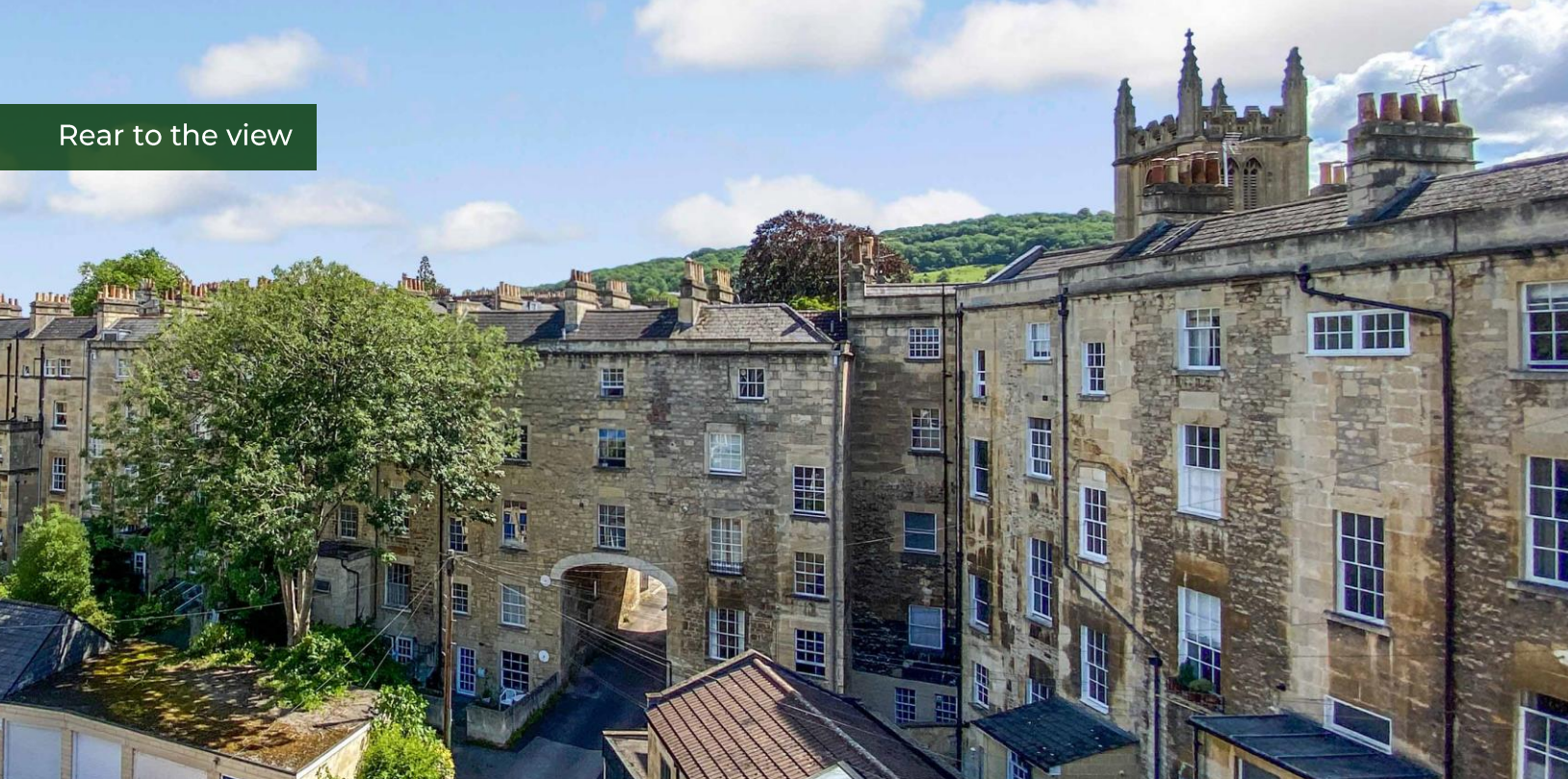
Rear to the view