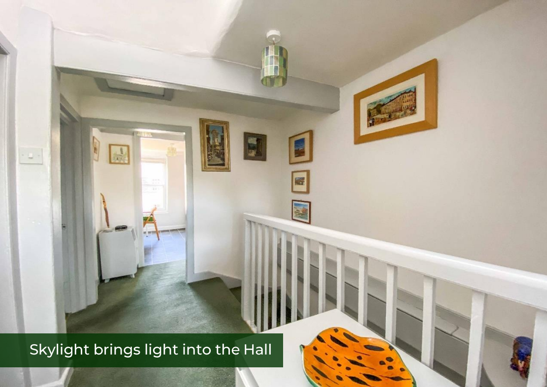
Skylight brings light into the Hall