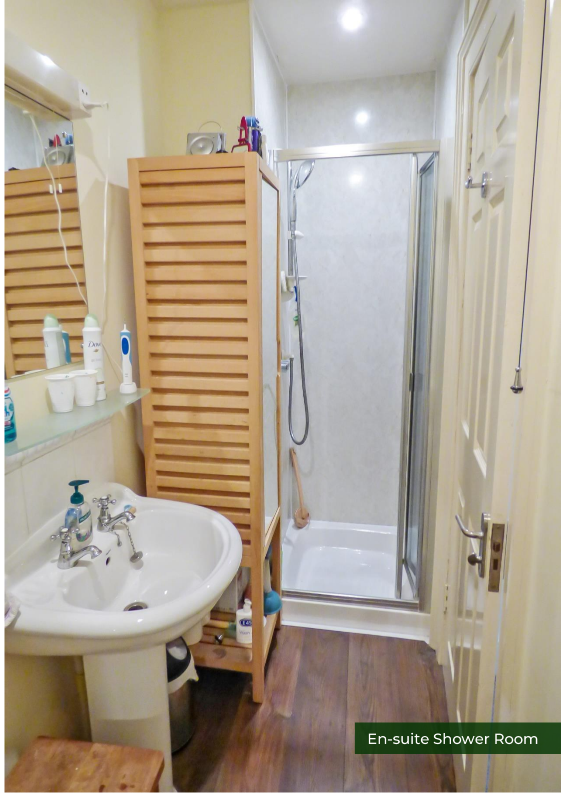
En-suite Shower Room