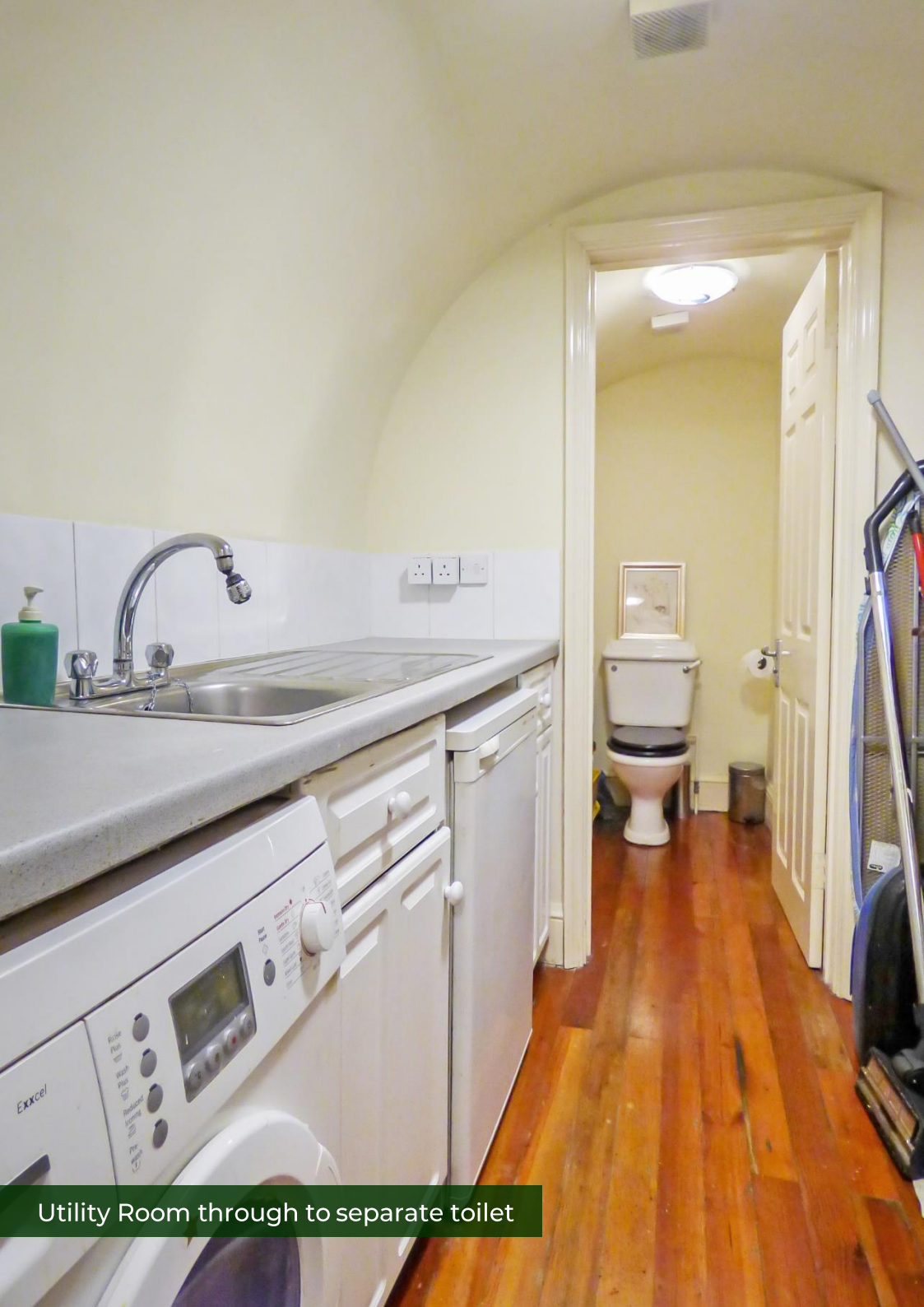
Utility Room through to separate toilet