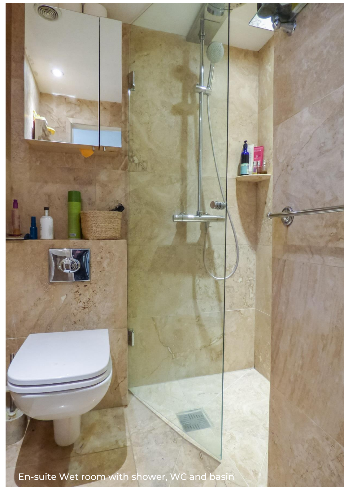
En-suite Wet room with shower, WC and basin