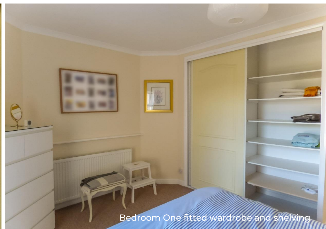
Bedroom One fitted wardrobe and shelving