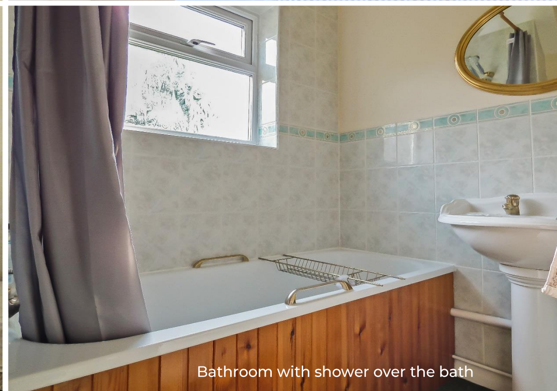
Bathroom with shower over the bath