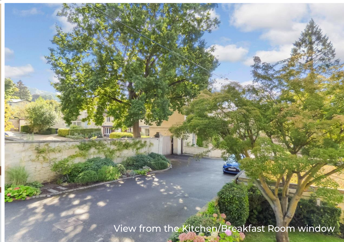
View from the Kitchen/Breakfast Room window