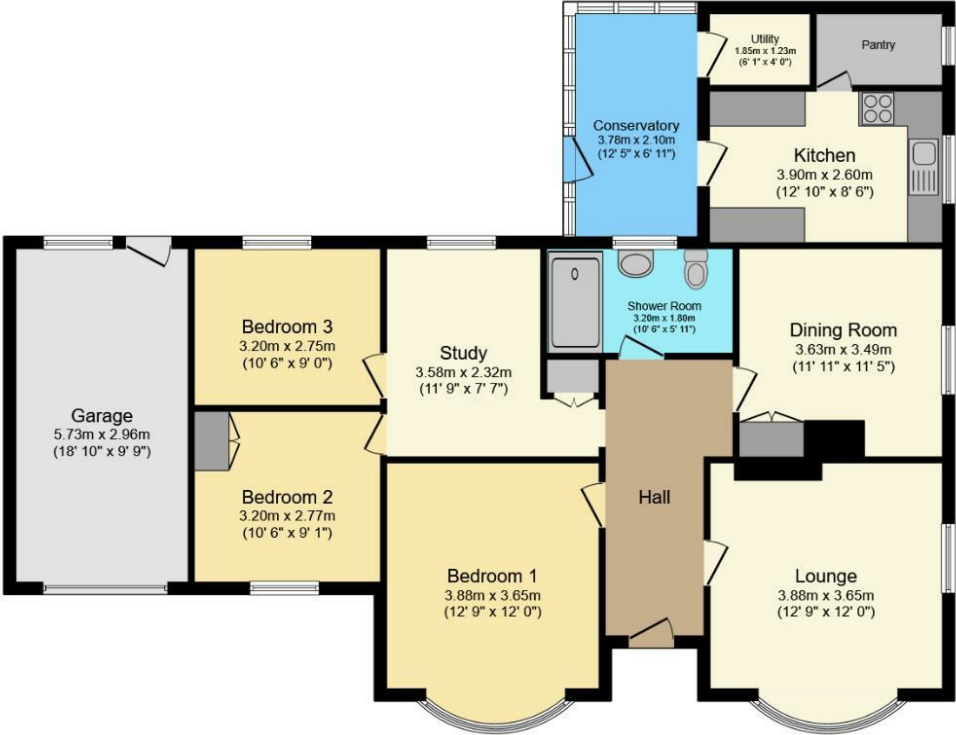
Floor Plan Floor area 134.4 sq.m. (1,447 sq.ft.)

The Hawthorns, Spilsby, Raithby, Raithby, PE23 4DT, GB