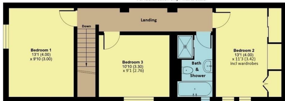
FIRST FLOOR APPROX FLOOR AREA 52.7 SQ M ( 568 SQ FT)