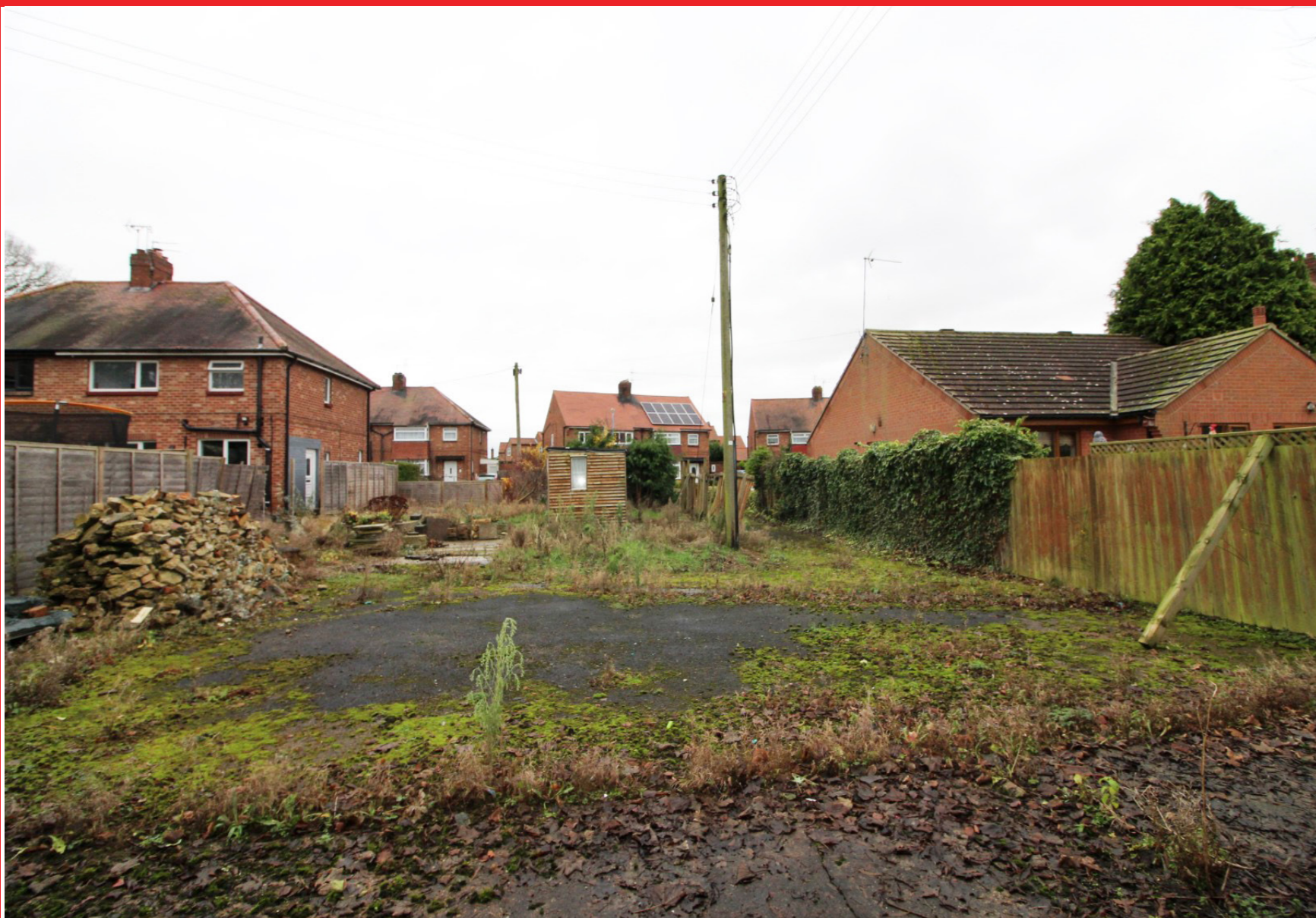
Building Plot south of 11 Park Avenue, Brandesburton, YO25 8QR