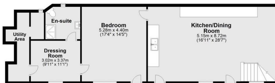
First Floor Approx. 107.4 sq. metres (1156.4 sq. feet)