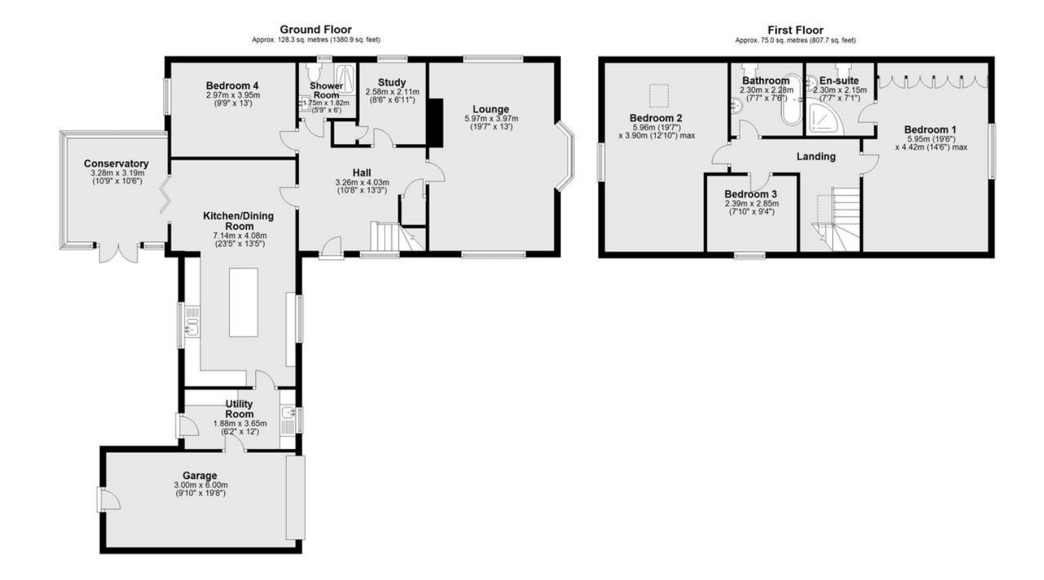
Total area: approx. 203.3 sq. metres (2188.5 sq. feet) For Illustration purposes only.