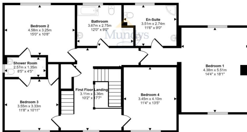
First Floor Approx 118 sq m / 1272 sq ft