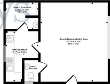
Annex Approx 36 sq m / 393 sq ft

This floorplan is only for illustrative purposes and is not to scale. Measurements of rooms, doors, windows, and any items are approximate and no responsibility is taken for any error, omission or mis-statement. Icons of items such as bathroom suites are representations only and may not look like the real items. Made with Made Snappy 360.